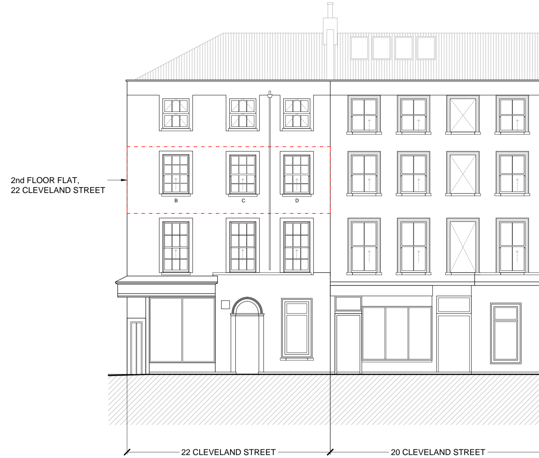
2 EXISTING - CLEVELAND STREET ELEVATION SCALE 1:100@A1 or 1:200@A3