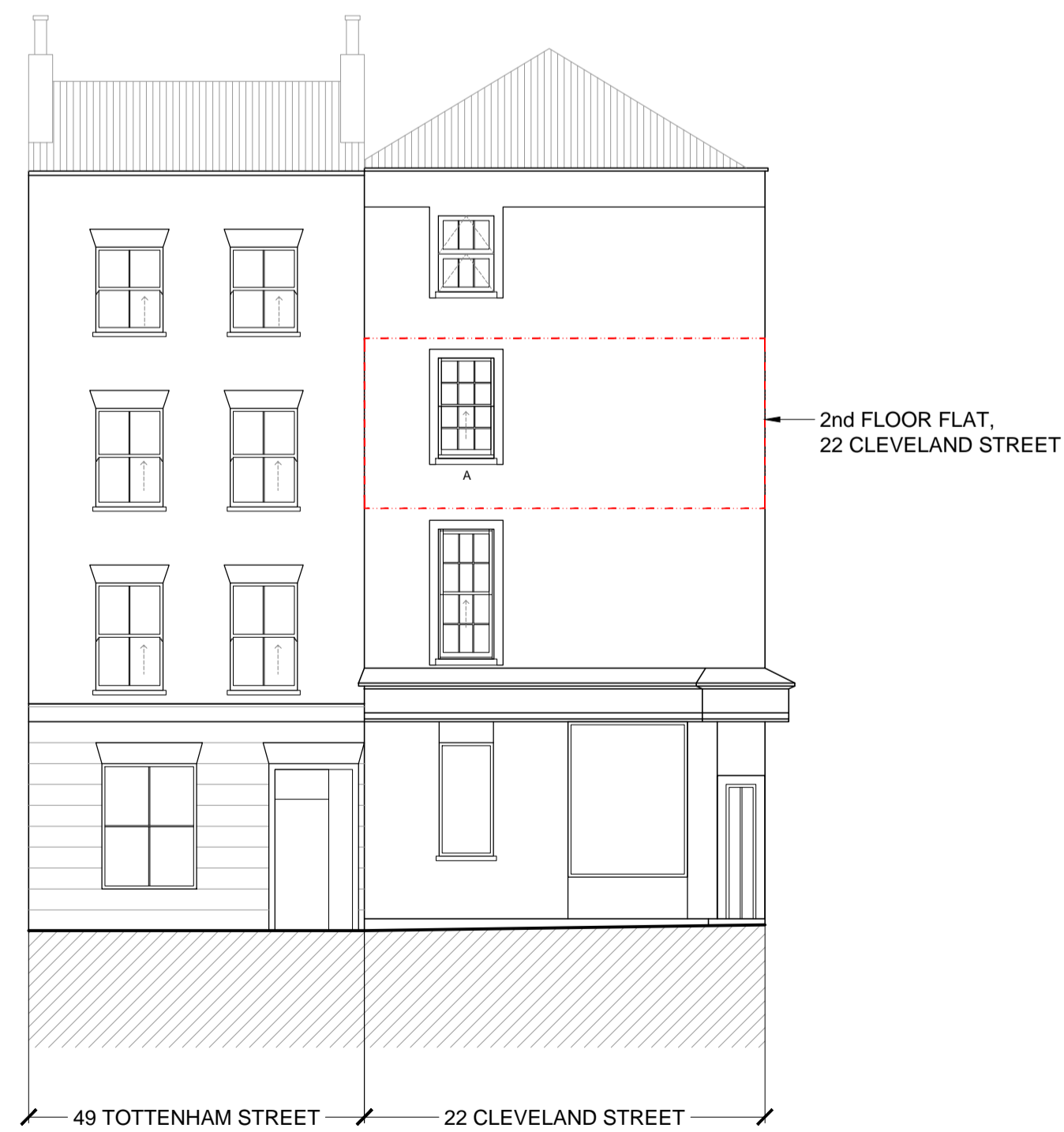
3 PROPOSED - TOTTENHAM STREET ELEVATION SCALE 1:100@A1 or 1:200@A3