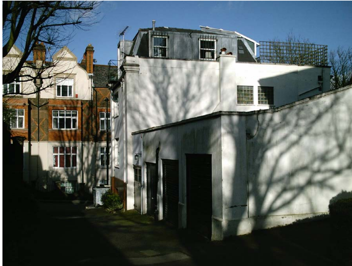
Rear view of Ladywell Court showing garage block and high-rise apartment buildings nearby.