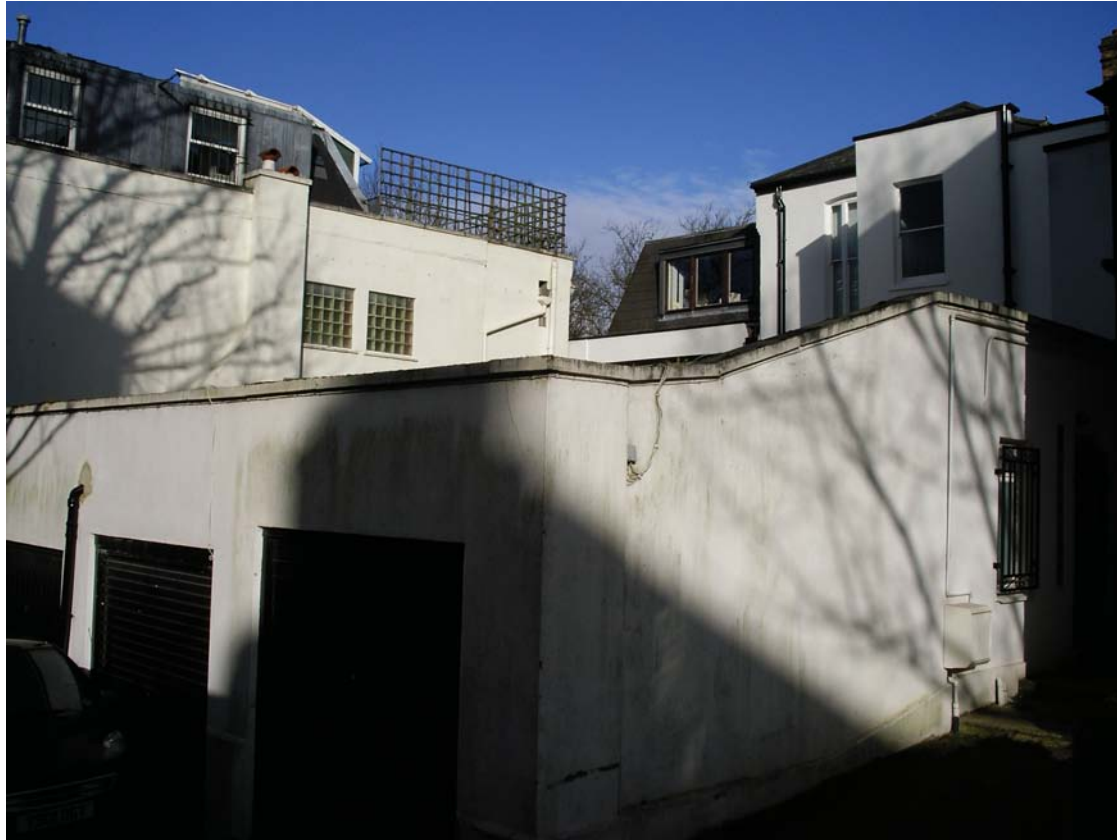
Rear view of Ladywell Court.