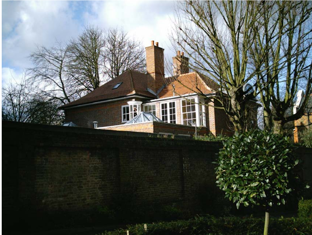
View of property opposite & 10ft. wall.