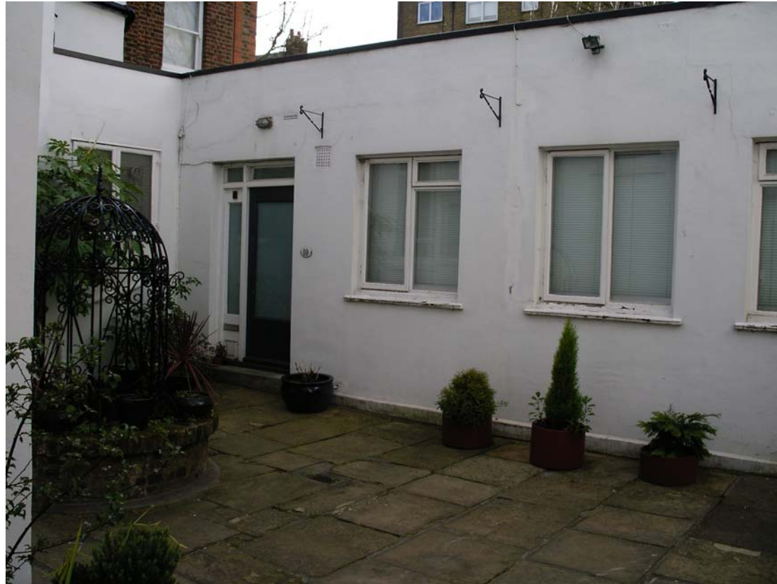
Front View of 10 Ladywell Court.