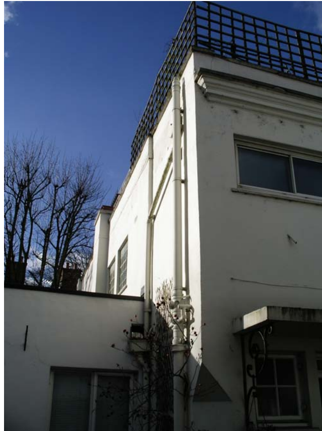
View of 10 Ladywell Court and adjoining apartment.