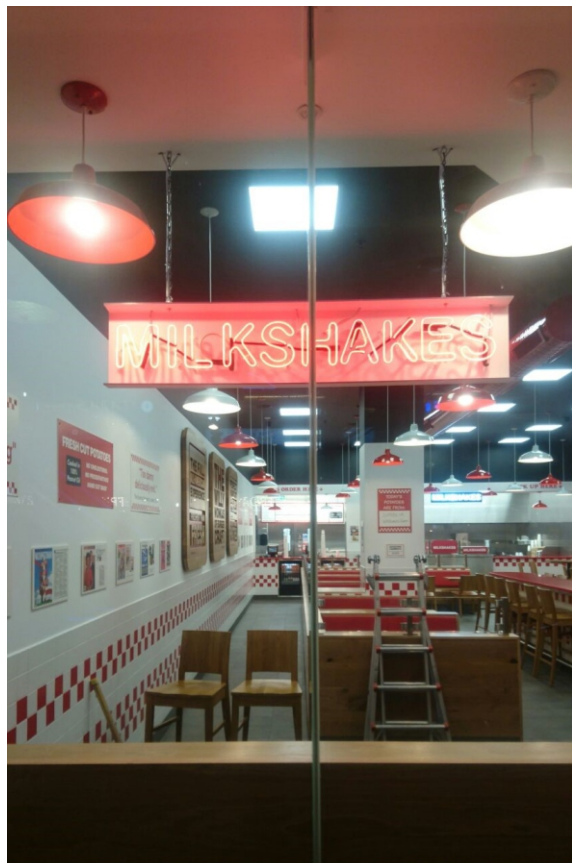
External Neon Milkshake Sign