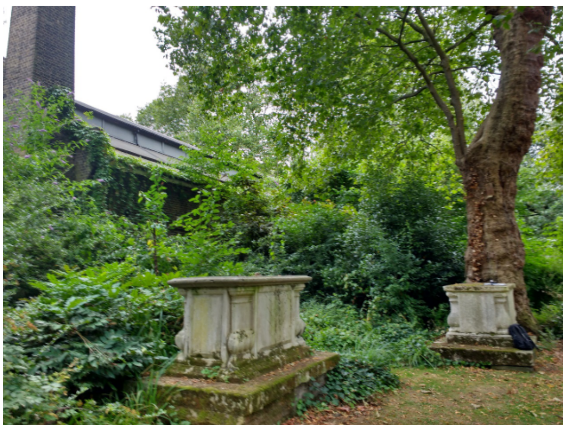
Photograph 6: London Plane 038 from north east

Client: Coram Foundation Project: Demolition works shrub clearance Location: Coram Community Campus, London WC1N 1AZ