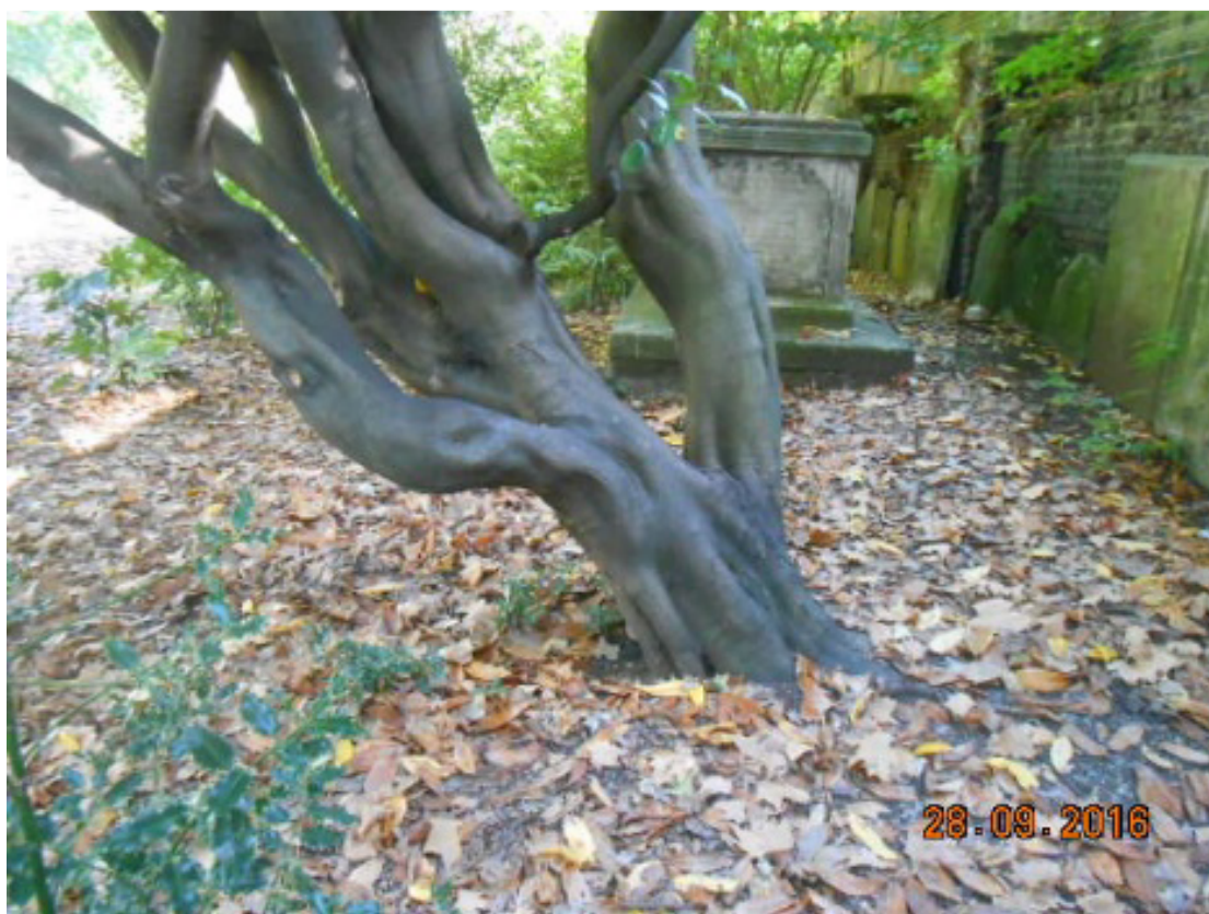
Photograph 4 3m Clearance Strip: large Portugal Laurel at south end - main stem

Client: Coram Foundation Project: Demolition works shrub clearance Location: Coram Community Campus, London WC1N 1AZ