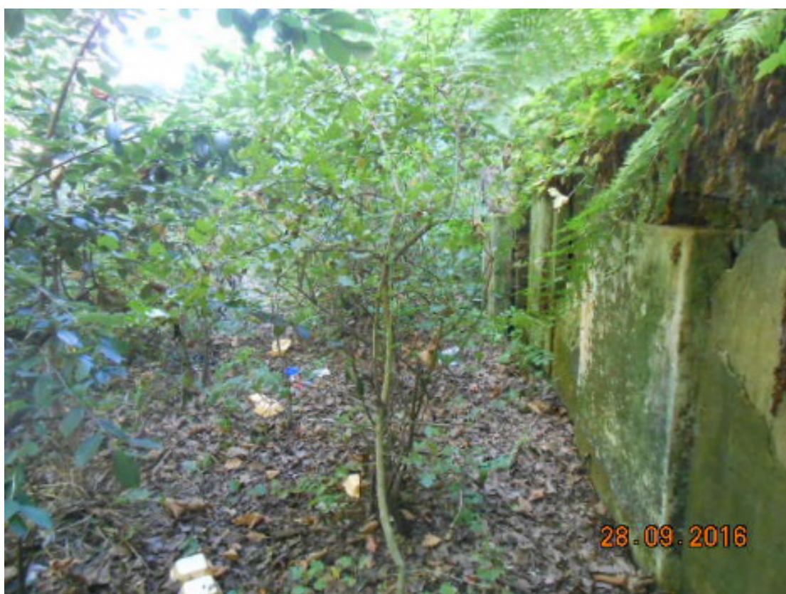
Photograph 2 3m Clearance Strip viewing from southern end

Client: Coram Foundation Project: Demolition works shrub clearance Location: Coram Community Campus, London WC1N 1AZ