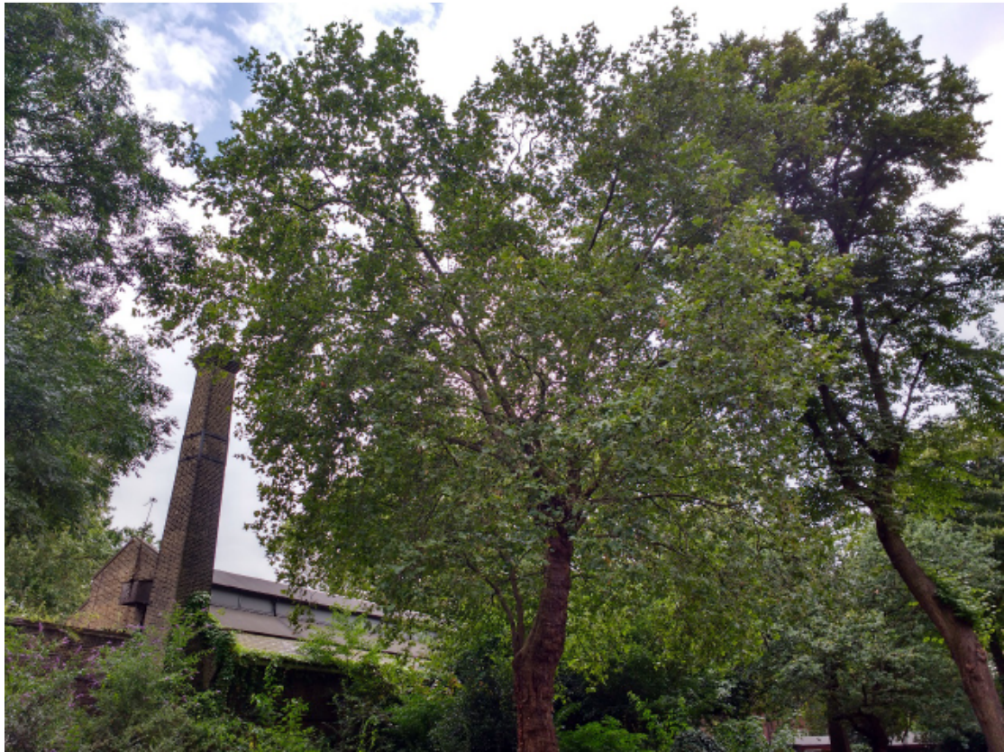
Photograph 7: London Plane 038 from east