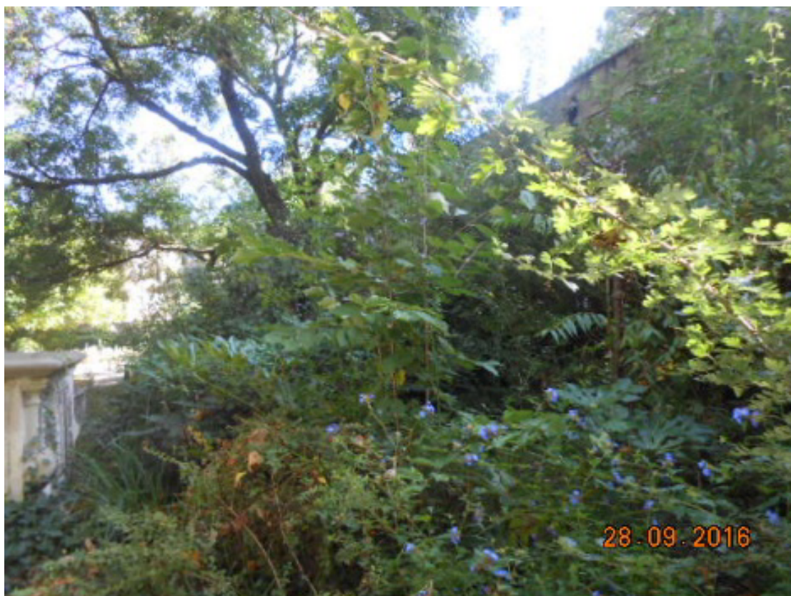
Photograph 5: London Plane 038 from south west