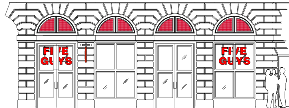
Proposed Elevation without café barriers or shop blinds Scale 1:100