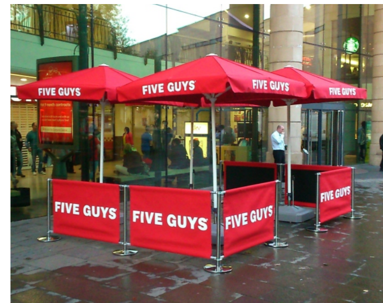
Typical Café Barriers