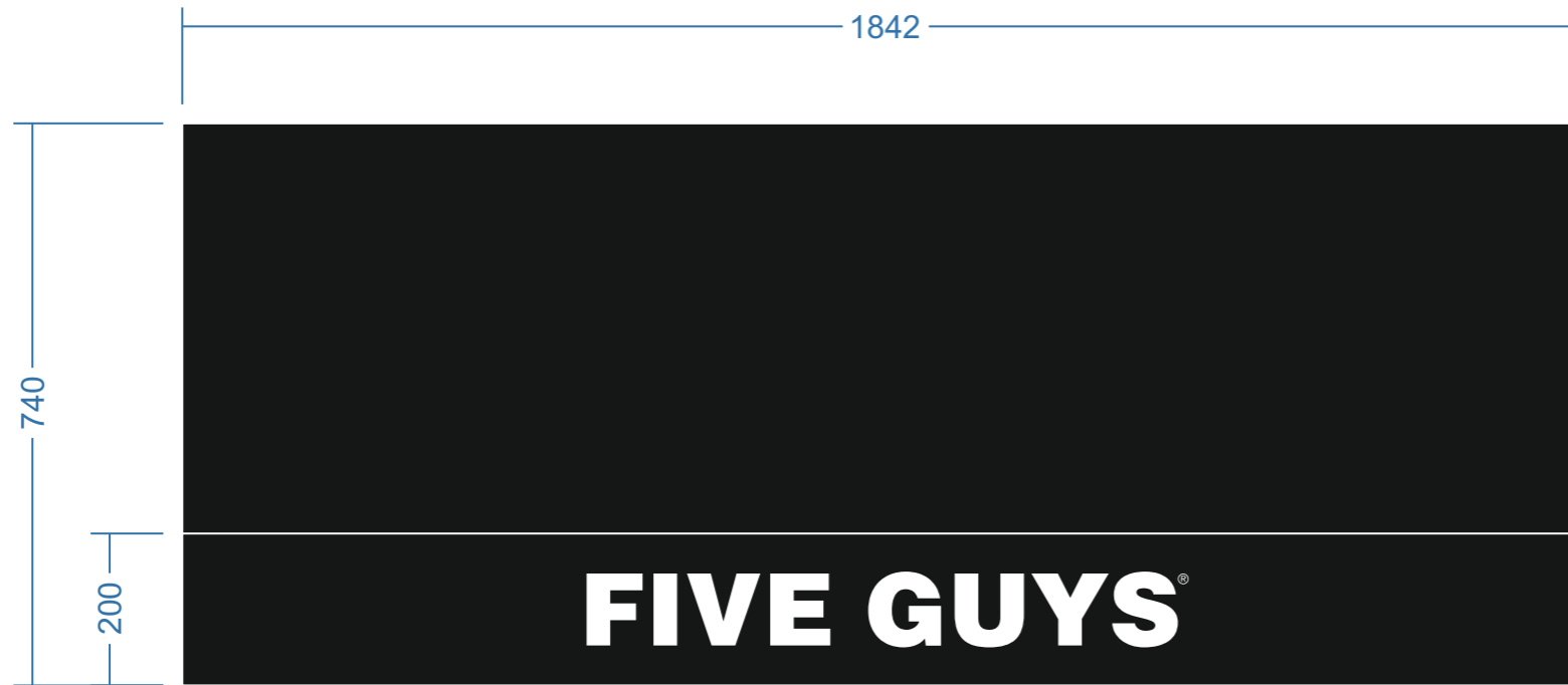
4No. Five Guys Canopies Scale 1:10