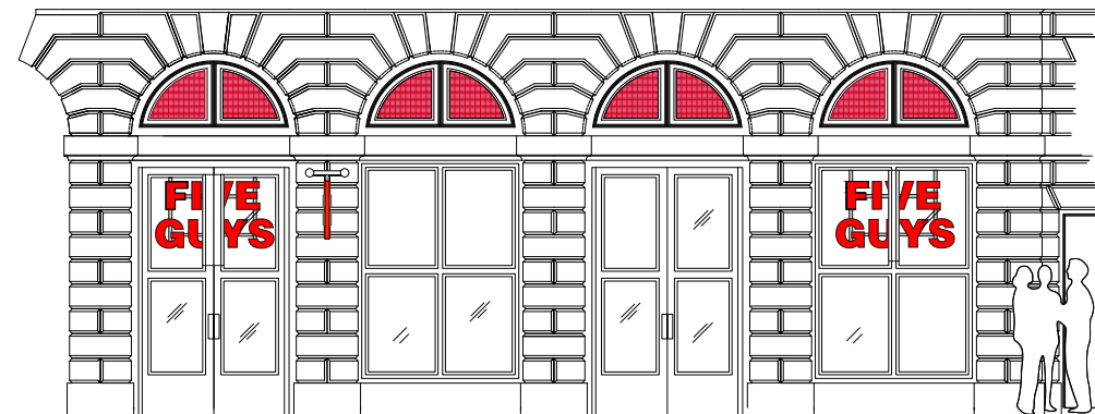
Proposed Elevation without café barriers or shop blinds Scale 1:100