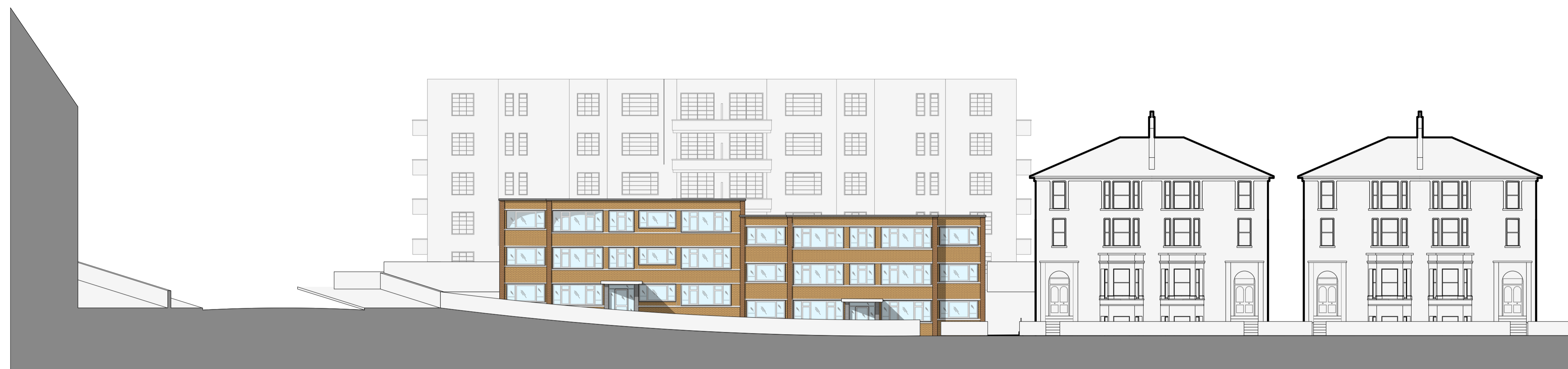
EXISTING SOUTH ELEVATIONS