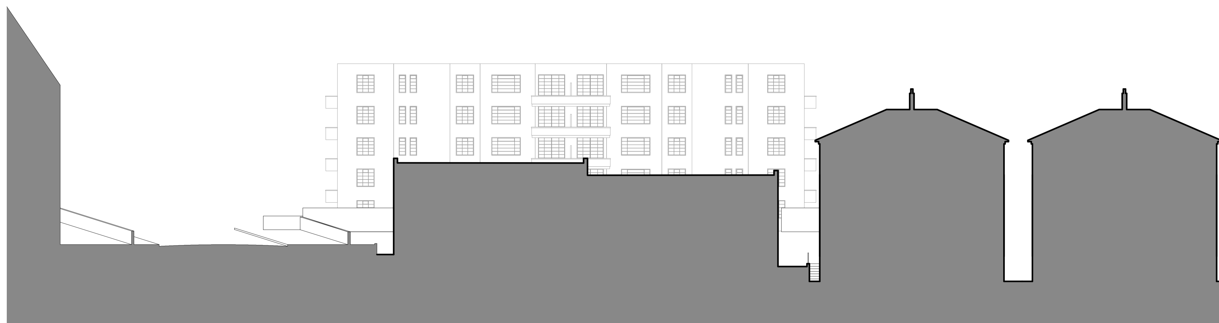
EXISTING SITE SECTION AA