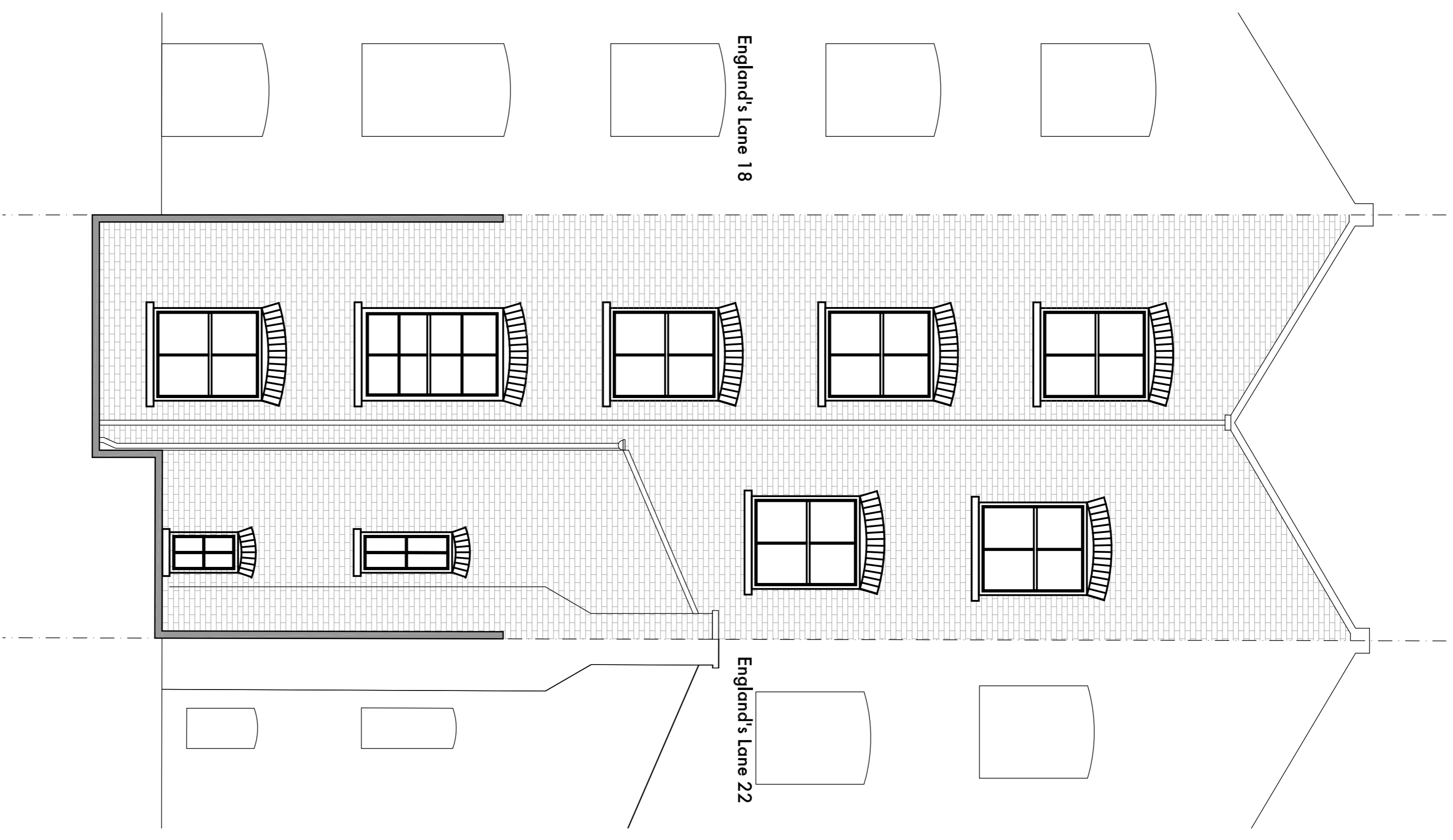
Elevation A-A' scale 1:50