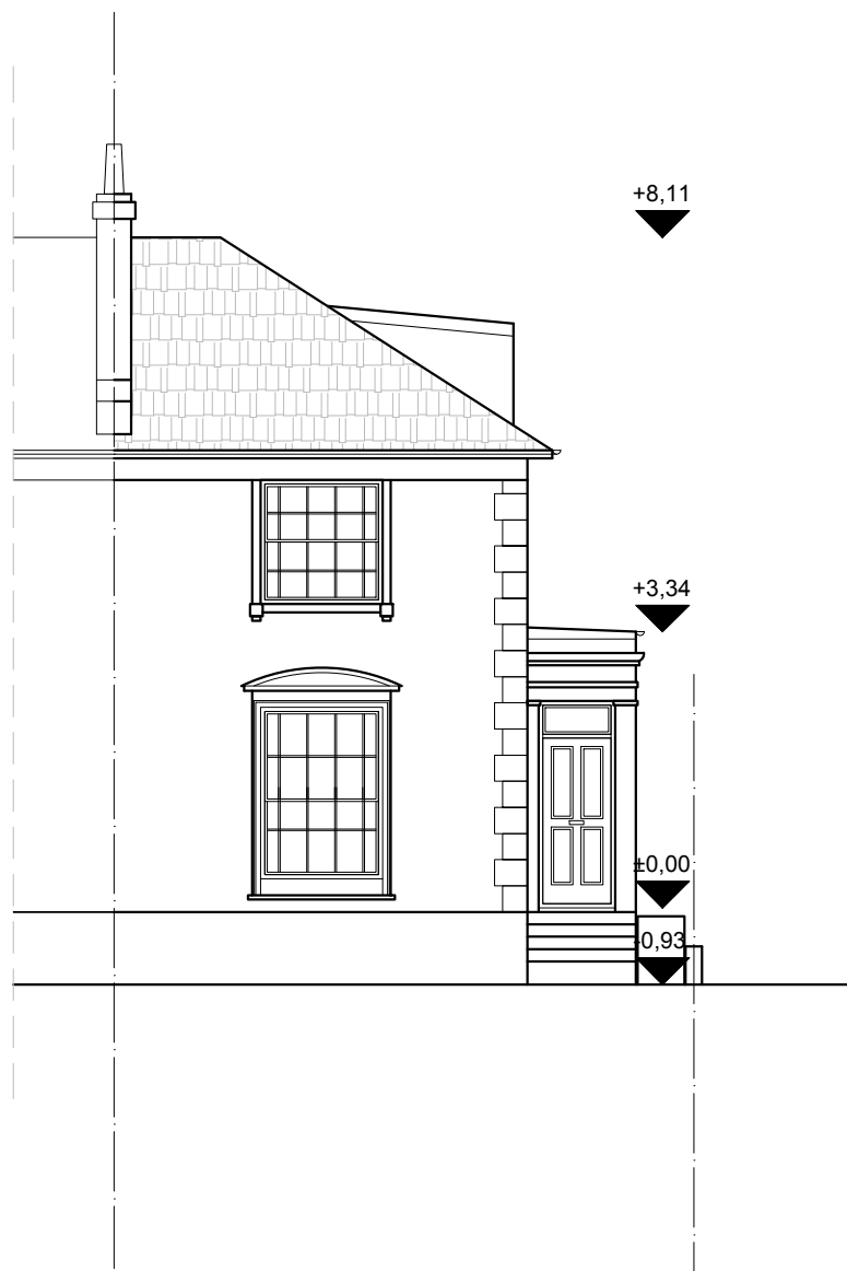
01 PROPOSED FRONT ELEVATION A-(15)-010 1:50@ A1, 1:100 @ A3