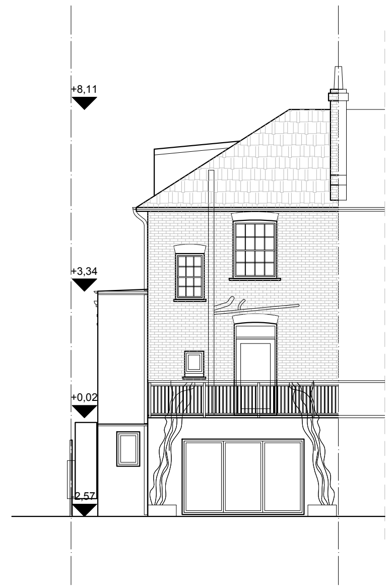
03 PROPOSED REAR ELEVATION A-(15)-010 1:50@ A1, 1:100 @ A3