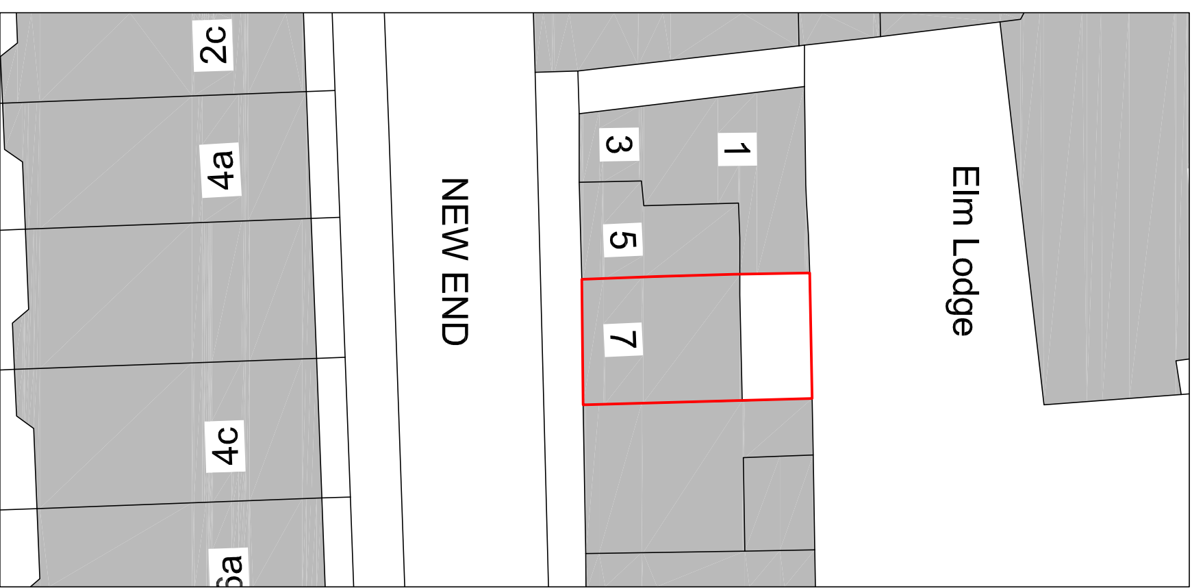
2 / Existing Site Plan, Scale 1:200