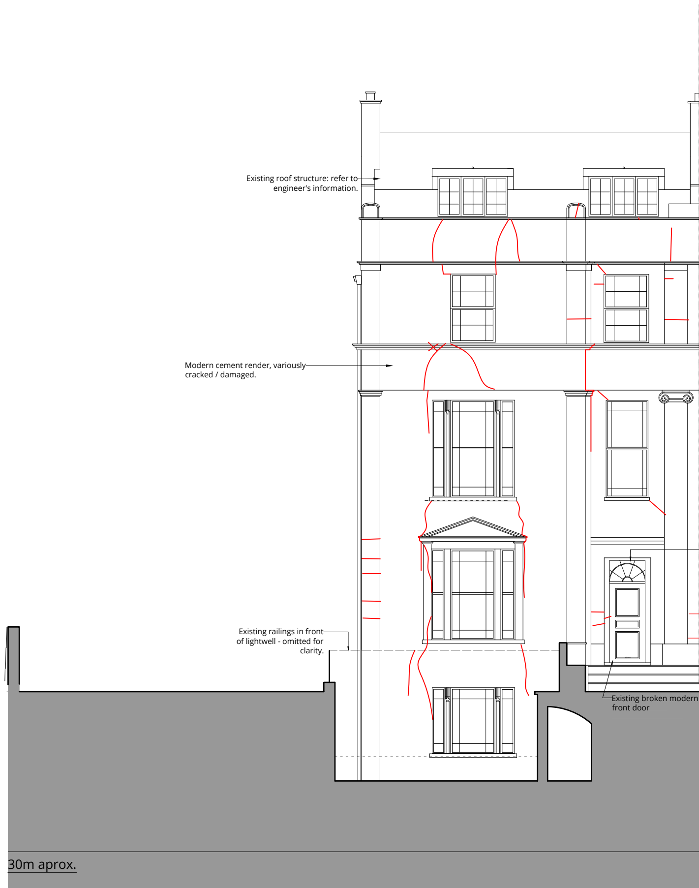
Existing front (south) elevation