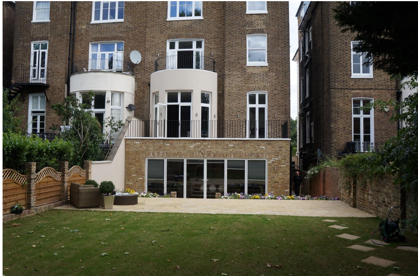
View of rear elevation with approved lower ground floor extension.

T + 44 (0) 207 229 1558 WWW.NASHBAKER.CO.UK MAIL@NASHBAKER.CO.UK