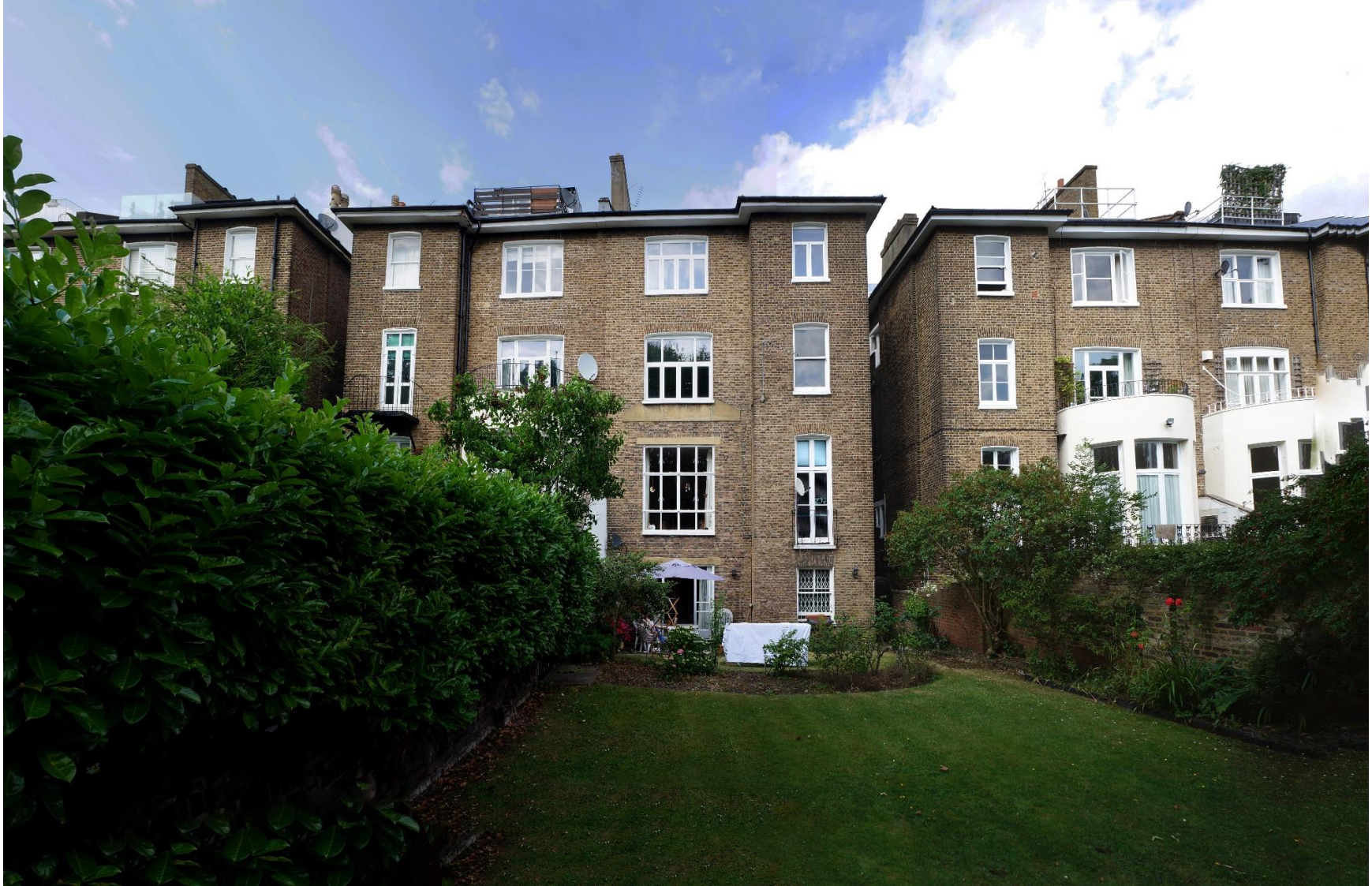
View of existing rear elevation and garden.