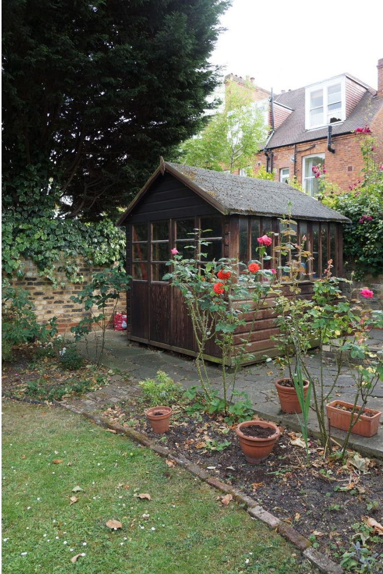
View of existing garden shed.