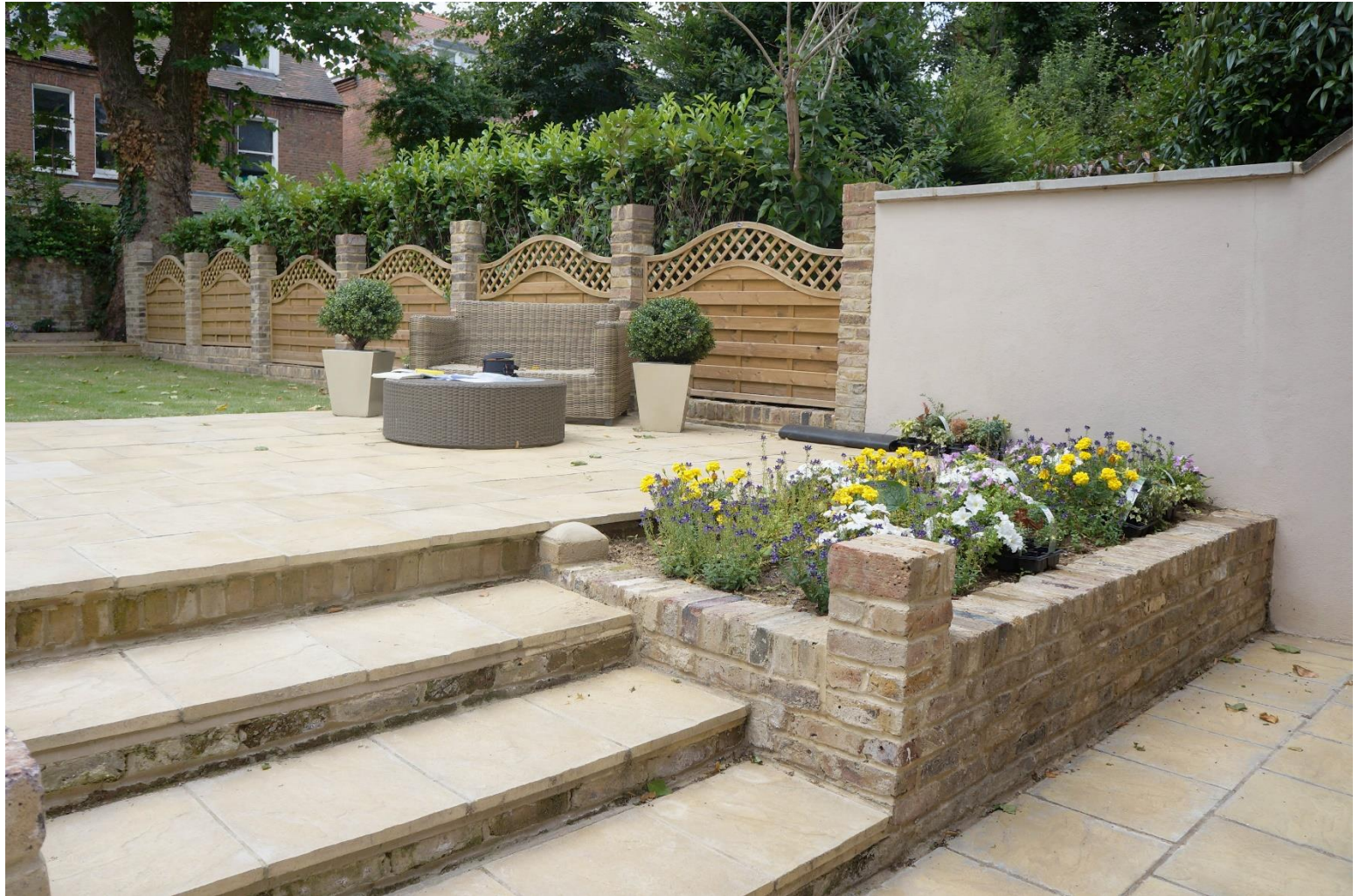
View of the proposed boundary fence wall with No. 73 Belsize Park Gardens.