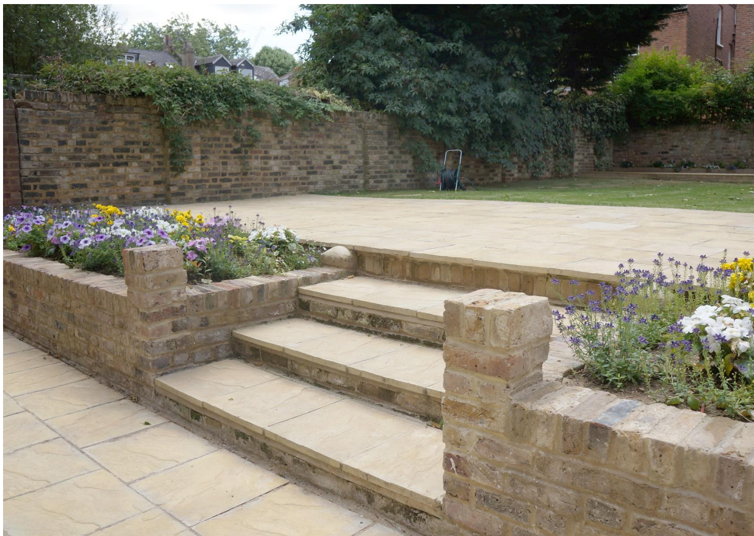
View of the proposed staircase and existing boundary with No. 77 Belsize Park Gardens.