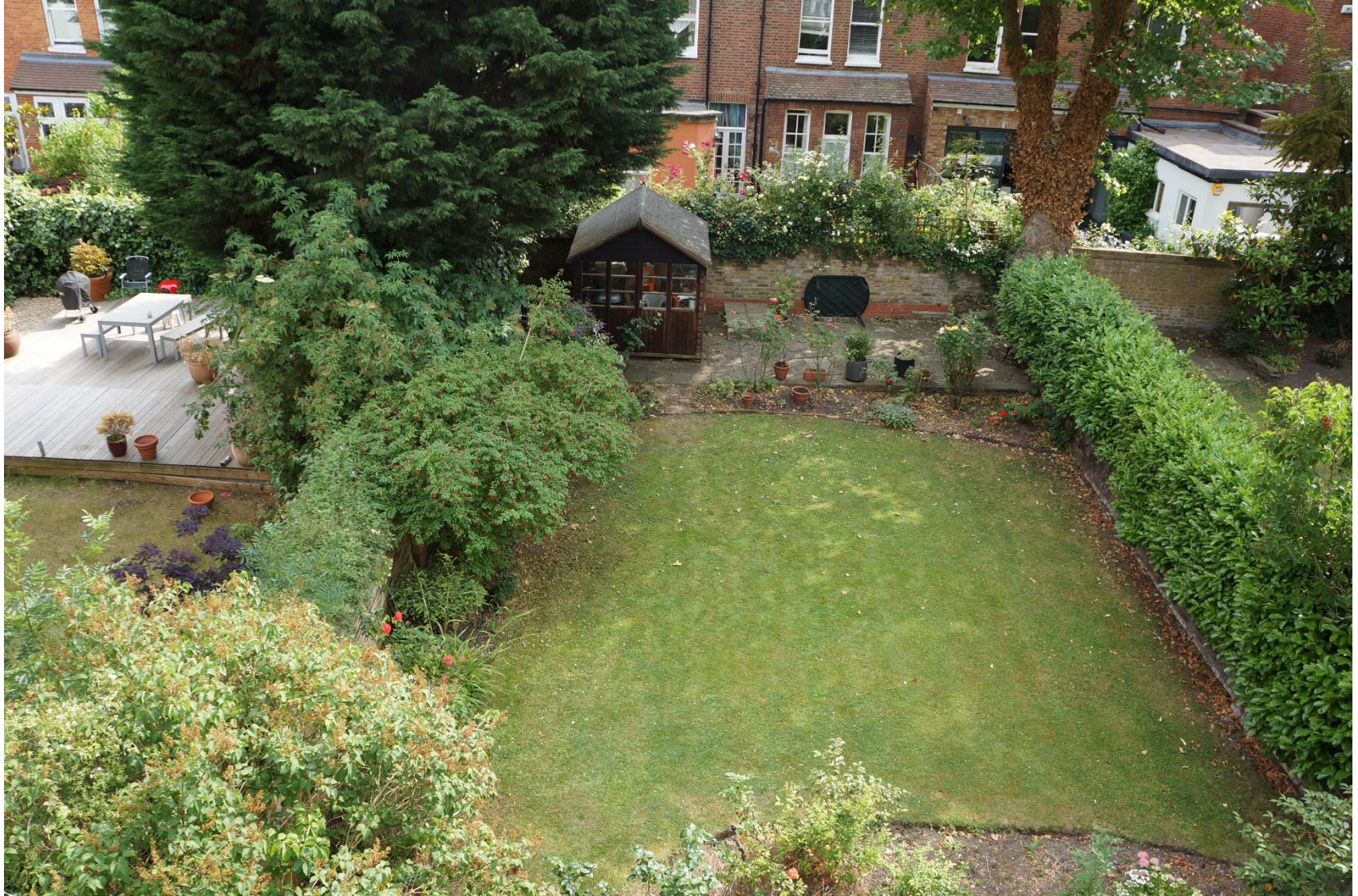
View from No.75 over the existing rear boundary of the garden.