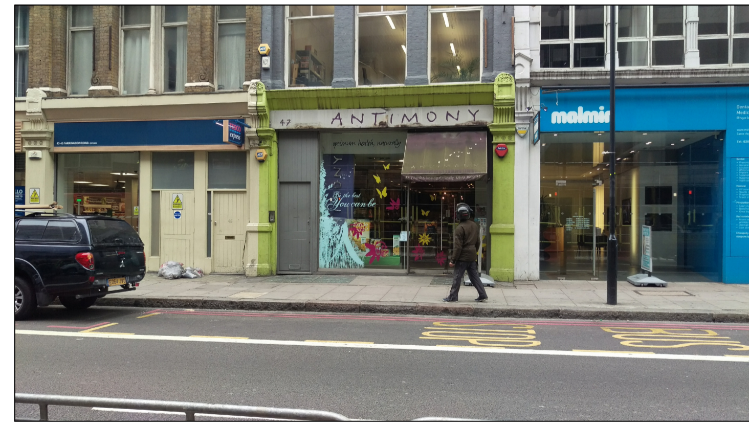
Existing Photos NTS