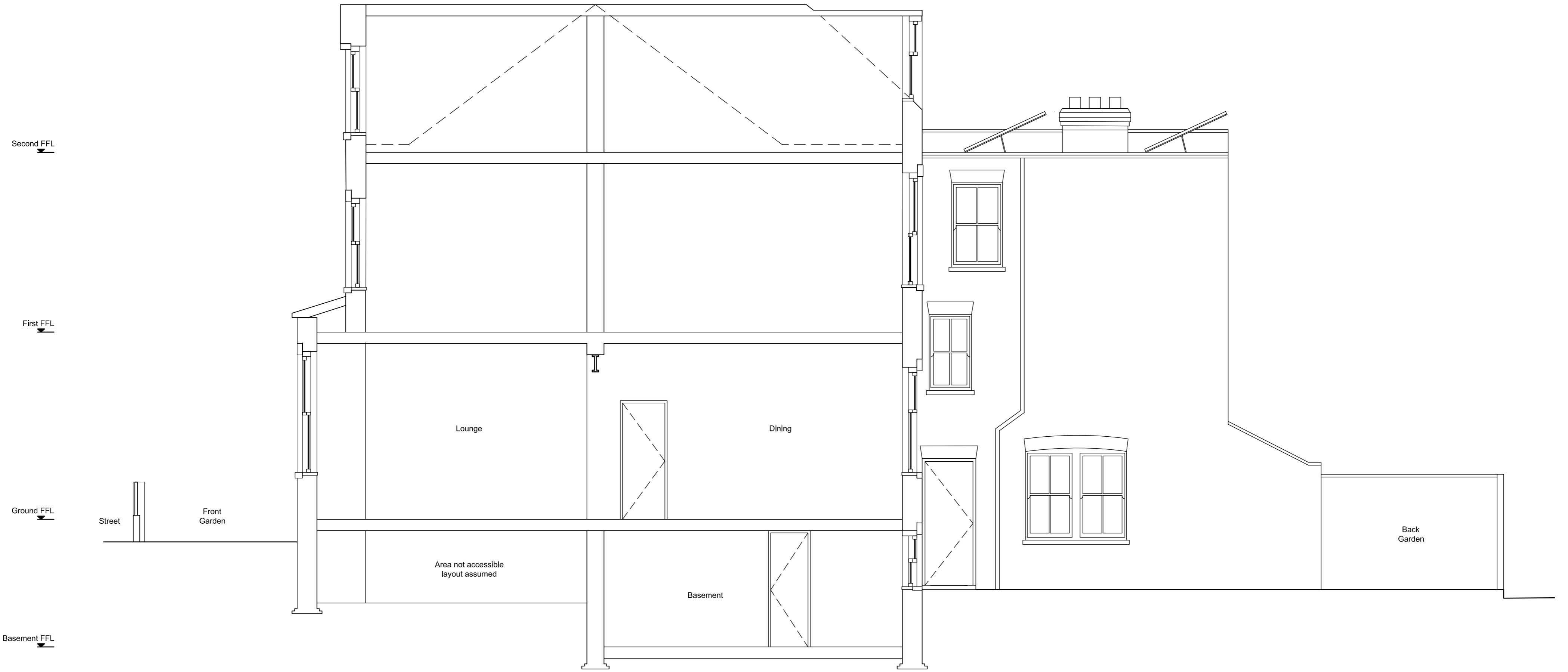
A Existing Long Section Scale 1:50

notes Do not scale from drawing Drawing indicates design intent only Any subsequent approvals do not release the trade obligations under the trade contract The trade contractor is responsible for taking and checking site dimensions Report all conflicts of information to the Architect If in doubt ask