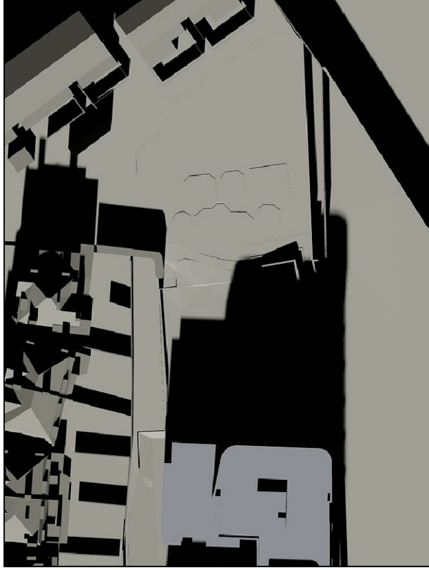
21st June 6pm Proposed