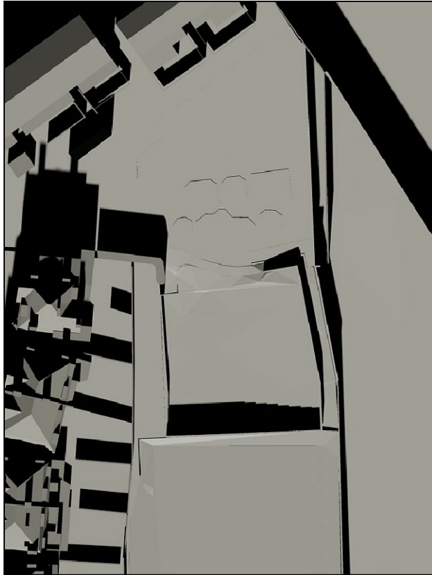
21st June 6pm Existing