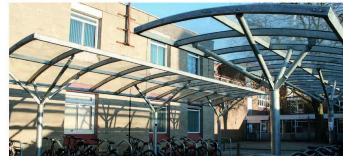
ADI Shelter, Buxton Community College