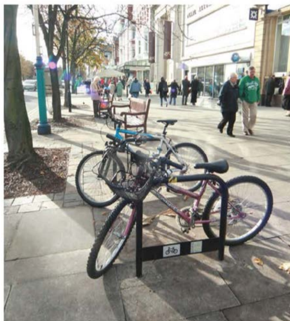
Sheffield Cycle Stands in Steel with bespoke Tipping Bar/Sign Strip, Southampton