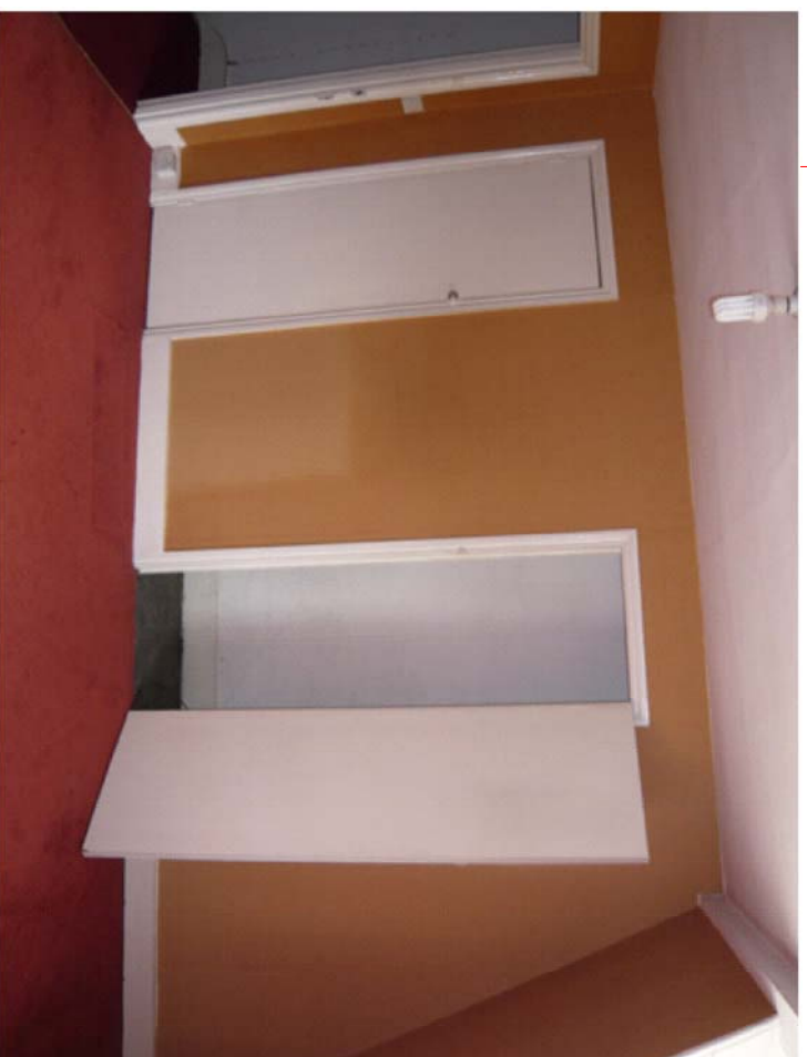
Remove new stud wall and doors and reinstate to large open room.