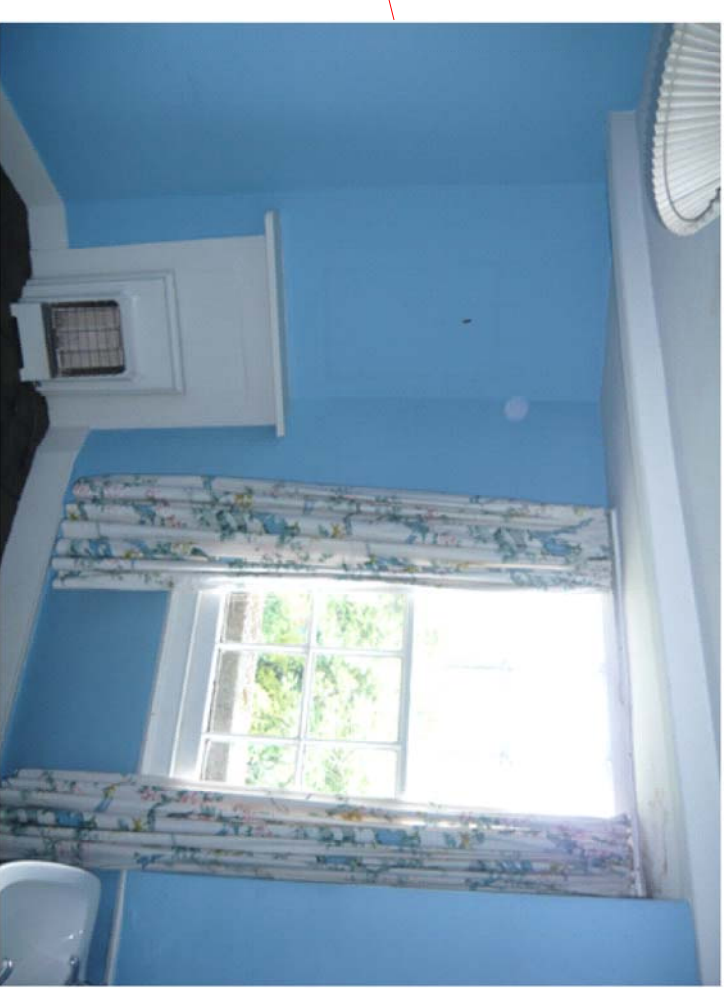
Overhaul and repair sash window. Retain fireplace surround and remove electric heater. Re-instate fireplace and hearth.