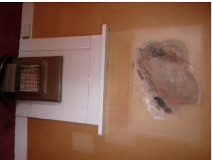
Retain fireplace surround and remove electric heater. Re-instate fireplace and hearth.