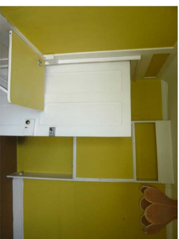
Strip and repaint timber door. Retain skirting and architrave. Retain and repair cornice.