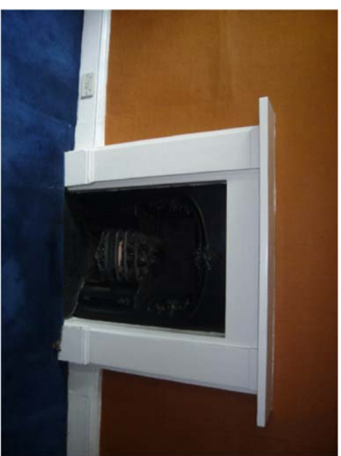
Fireplace to be removed.