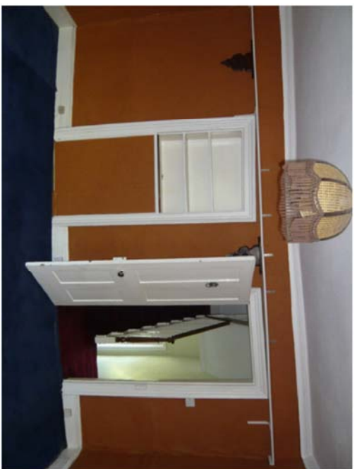
Existing bedroom door to be removed and re-hung on new wall partition and bedroom entrance. The adjacent alcove/shelving with architrave shelving is to be removed and blocked up.