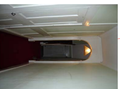
Retain wooden wall panelling and wooden staircase with balustrade. Retain sitting room door architrave however block up doorway .