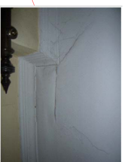
Retain and repair areas of water damaged lath and plaster ceiling and cornice.