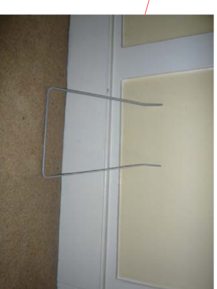
Retain, strip and paint skirting board.