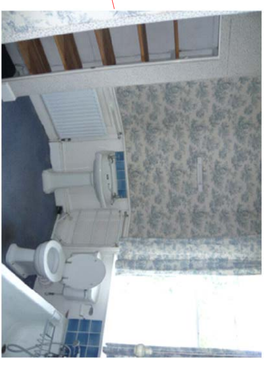
Overhaul and repair sash window. Repair and retain cornice. New bathroom stud wall partition shall have moulded plaster cornice and timber skirting to match the existing.