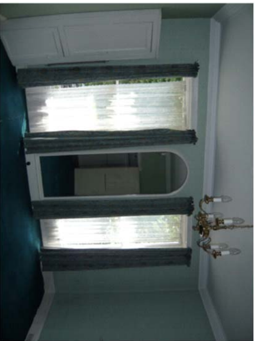
Overhaul and repair sash windows. Retain skirting and floorboards.