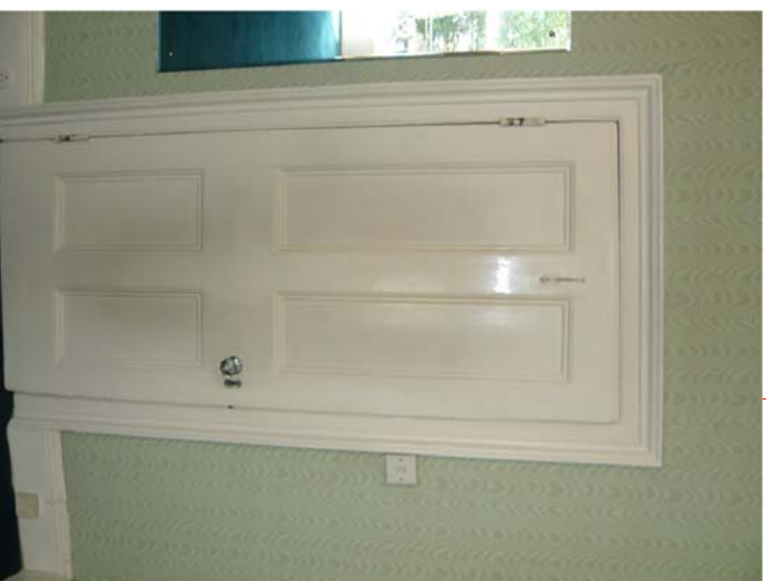
Strip and repaint timber door. Retain skirting and architrave. Remove cupb. door and retain door opening with architrave.