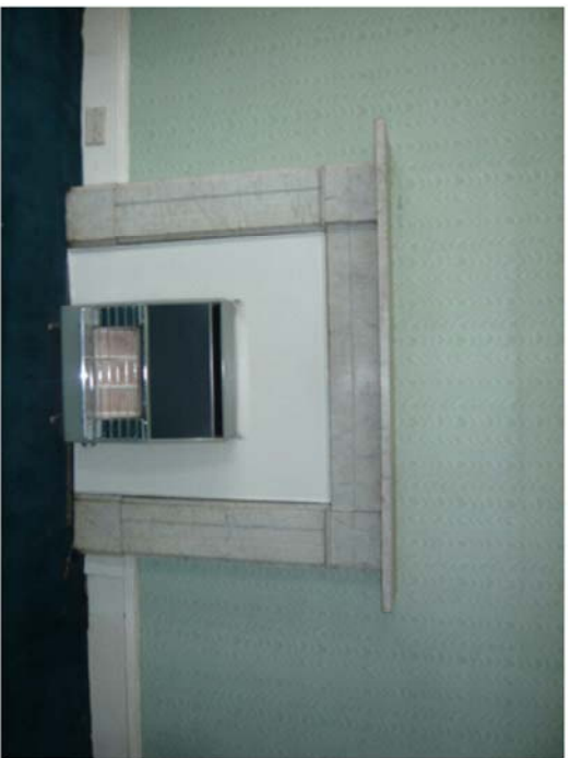
Existing fireplace surround to be retained. The fireplace and hearth to be reinstated.