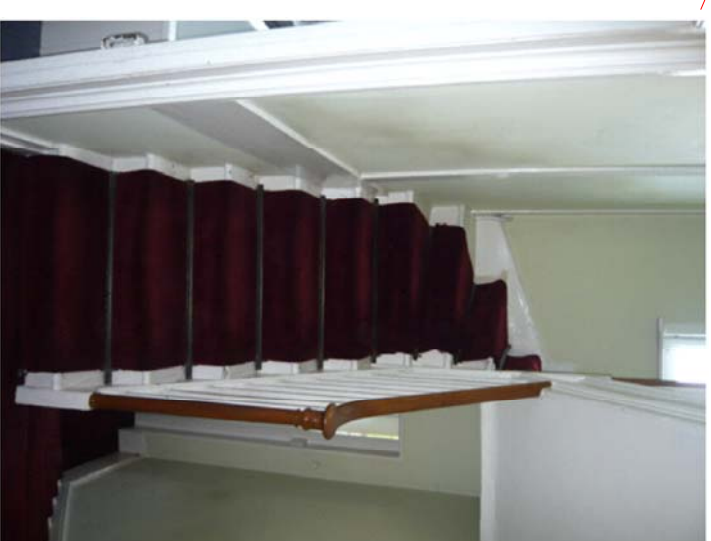
Retain hallway panelling. Retain wooden staircase and balustrade.