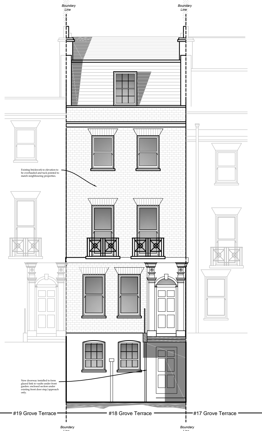
FRONT ELEVATION - STREET (SCALE 1:100)