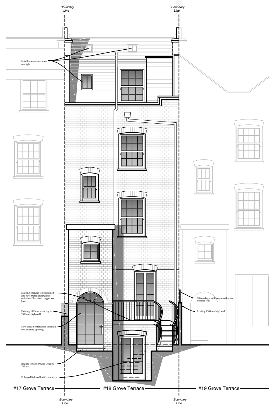
REAR ELEVATION - GARDEN (SCALE 1:100)