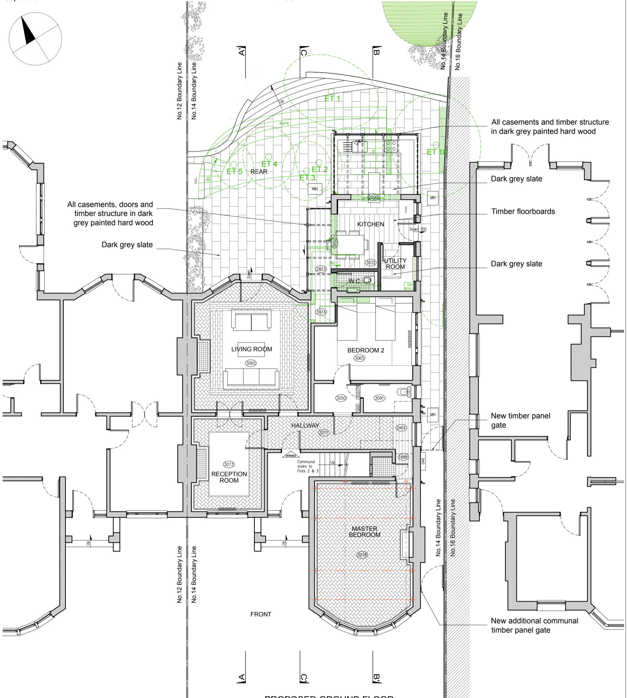
PROPOSED GROUND FLOOR

ONLY FLAT 1, 14 FERNCROFT AVENUE HAS BEEN SURVEYED BY THiiNK DESIGN. ALL CONTEXT BUILDINGS ARE INDICATIVE ONLY