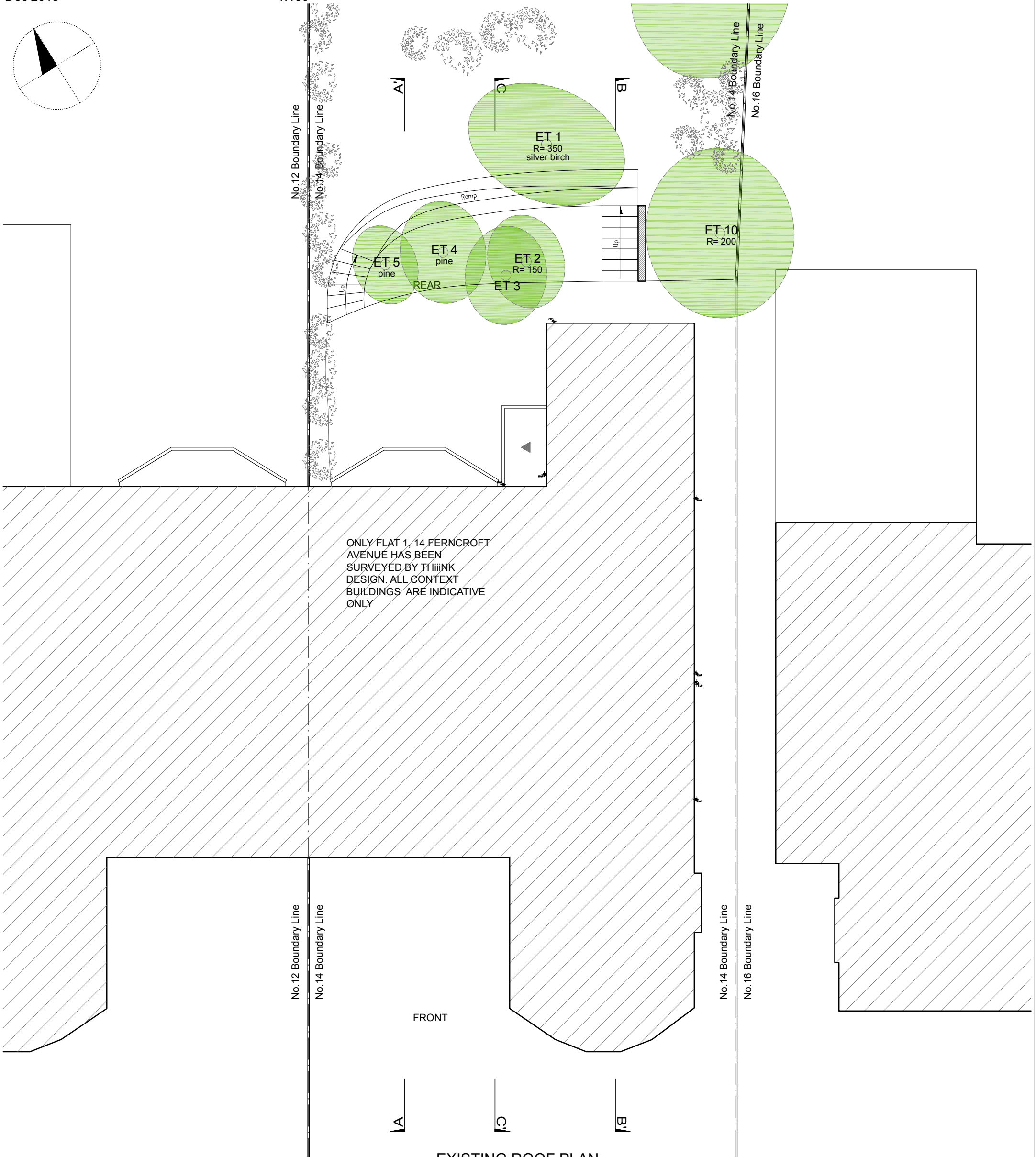
EXISTING ROOF PLAN

ONLY FLAT 1, 14 FERNCROFT AVENUE HAS BEEN SURVEYED BY THiiNK DESIGN. ALL CONTEXT BUILDINGS ARE INDICATIVE ONLY