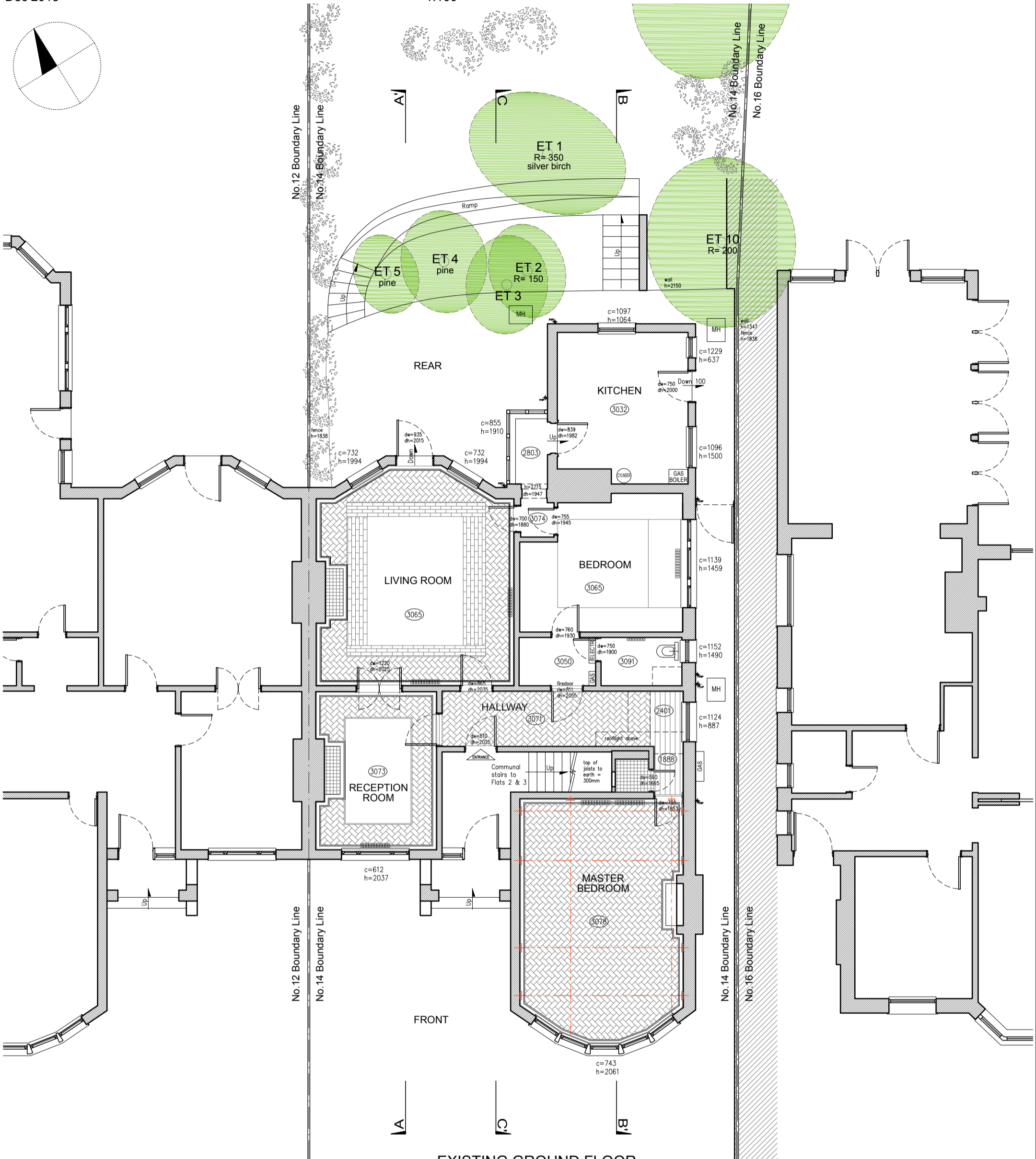
EXISTING GROUND FLOOR

ONLY FLAT 1, 14 FERNCROFT AVENUE HAS BEEN SURVEYED BY THiiNK DESIGN. ALL CONTEXT BUILDINGS ARE INDICATIVE ONLY