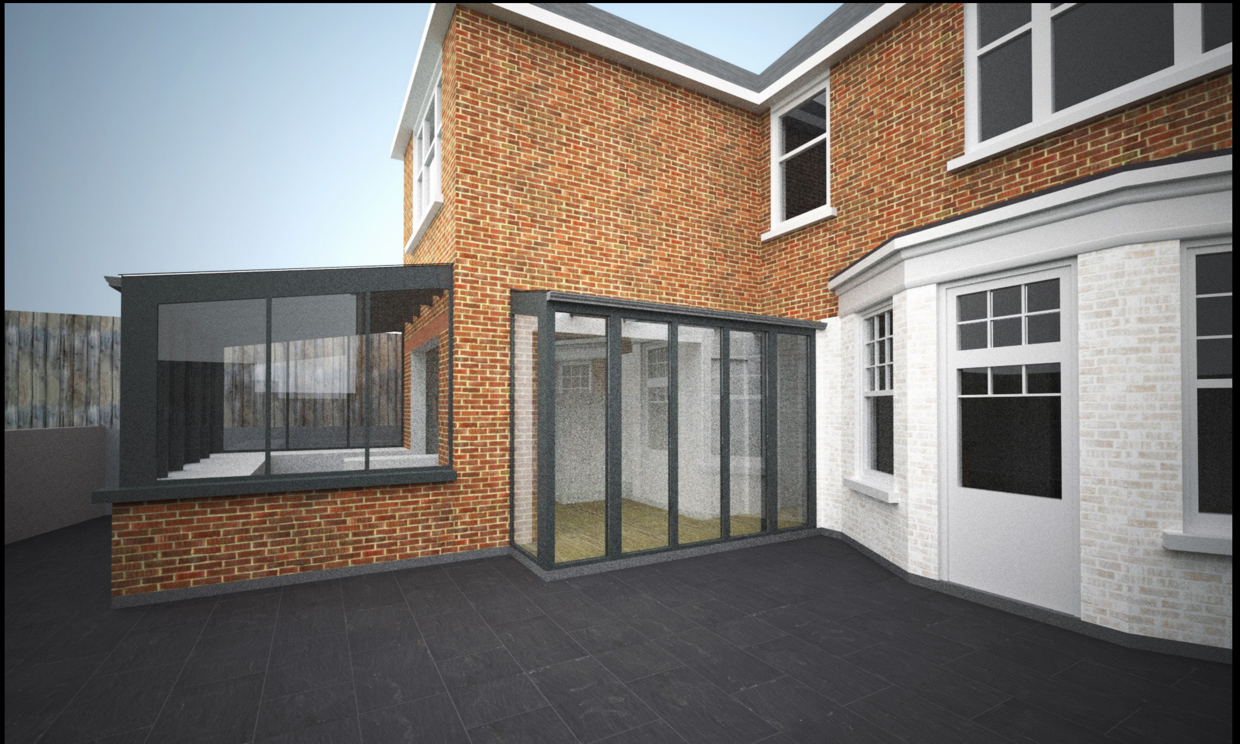
Flat 1, 14 Ferncroft Avenue - proposed rear extensions, facing Southeast