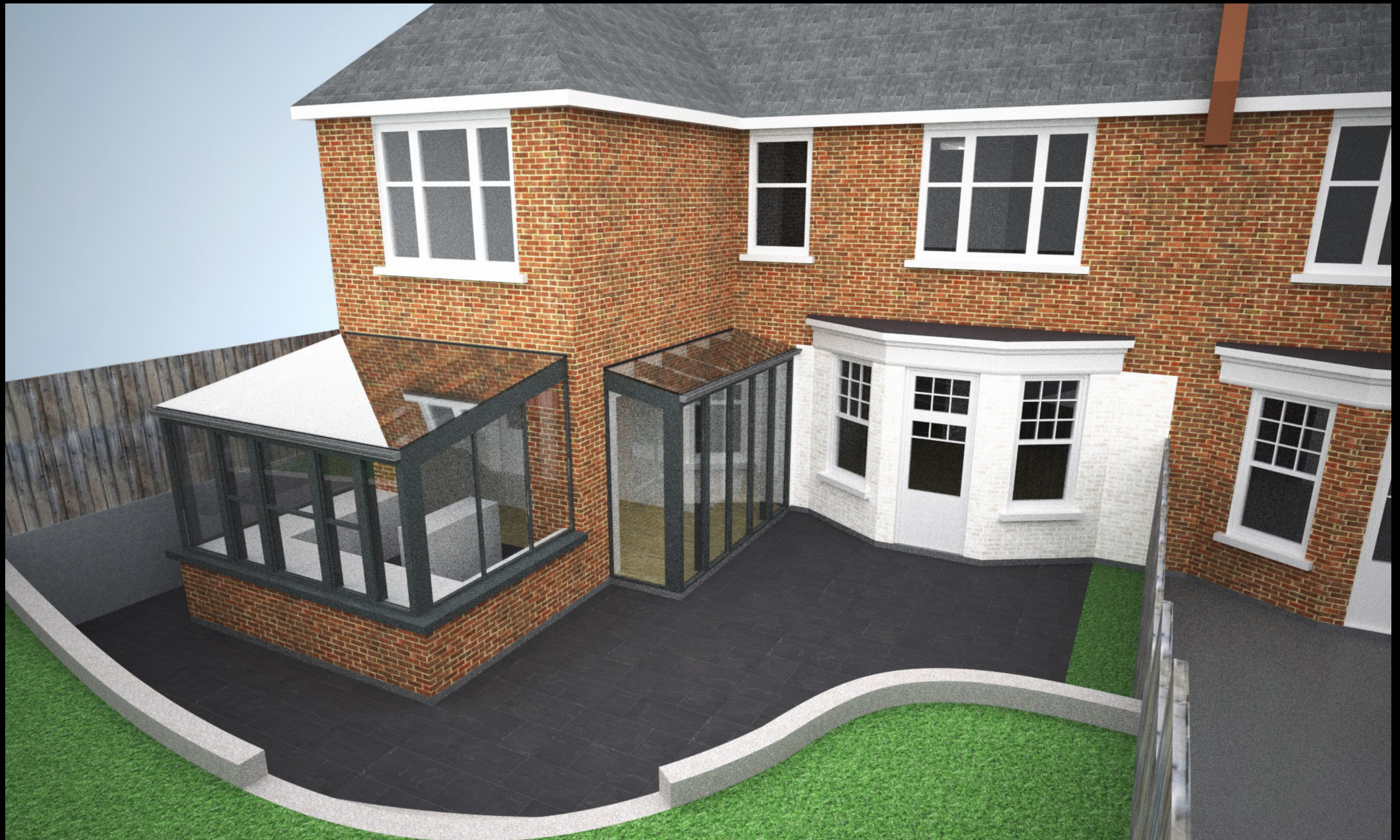
Flat 1, 14 Ferncroft Avenue - proposed rear extensions, facing South