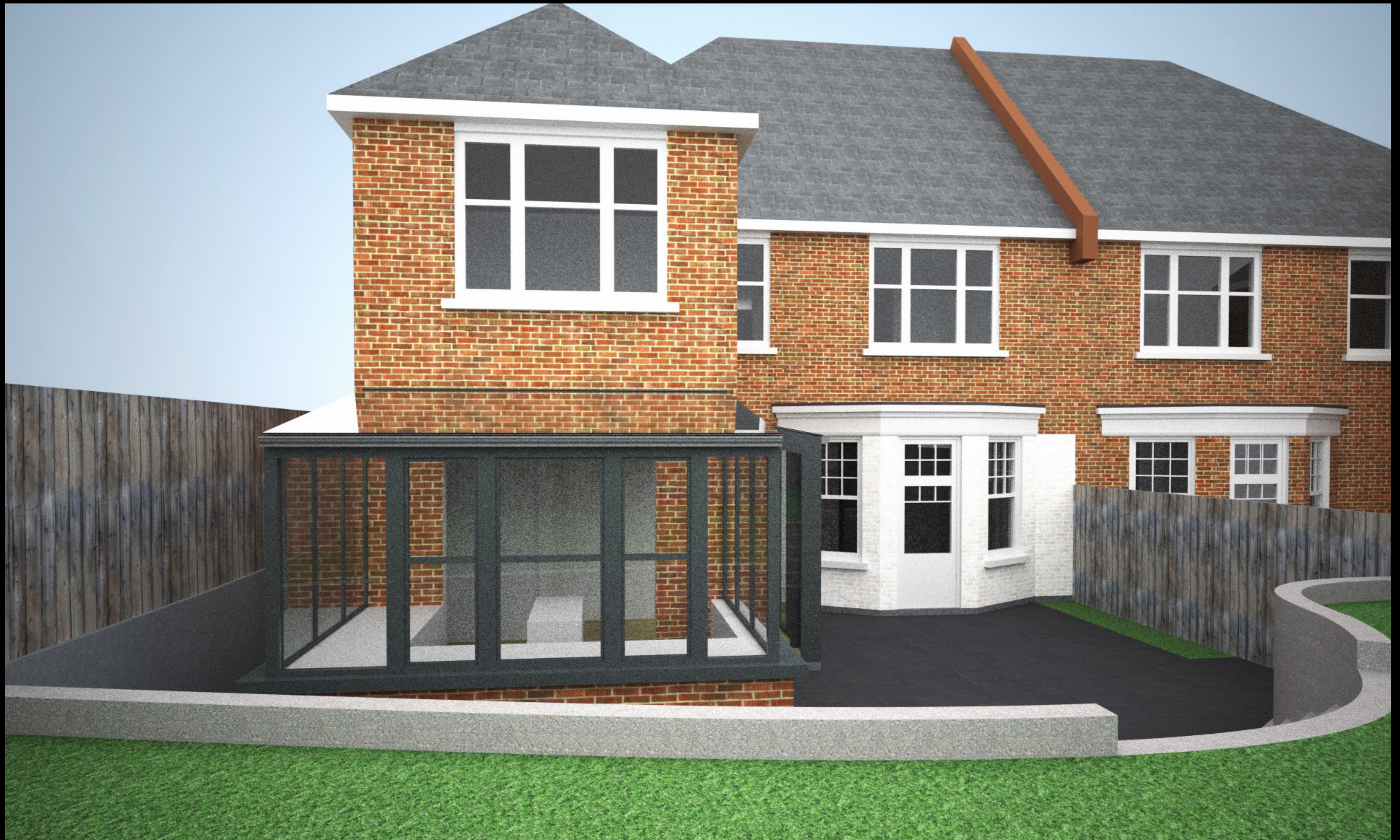
Flat 1, 14 Ferncroft Avenue - proposed rear elevation