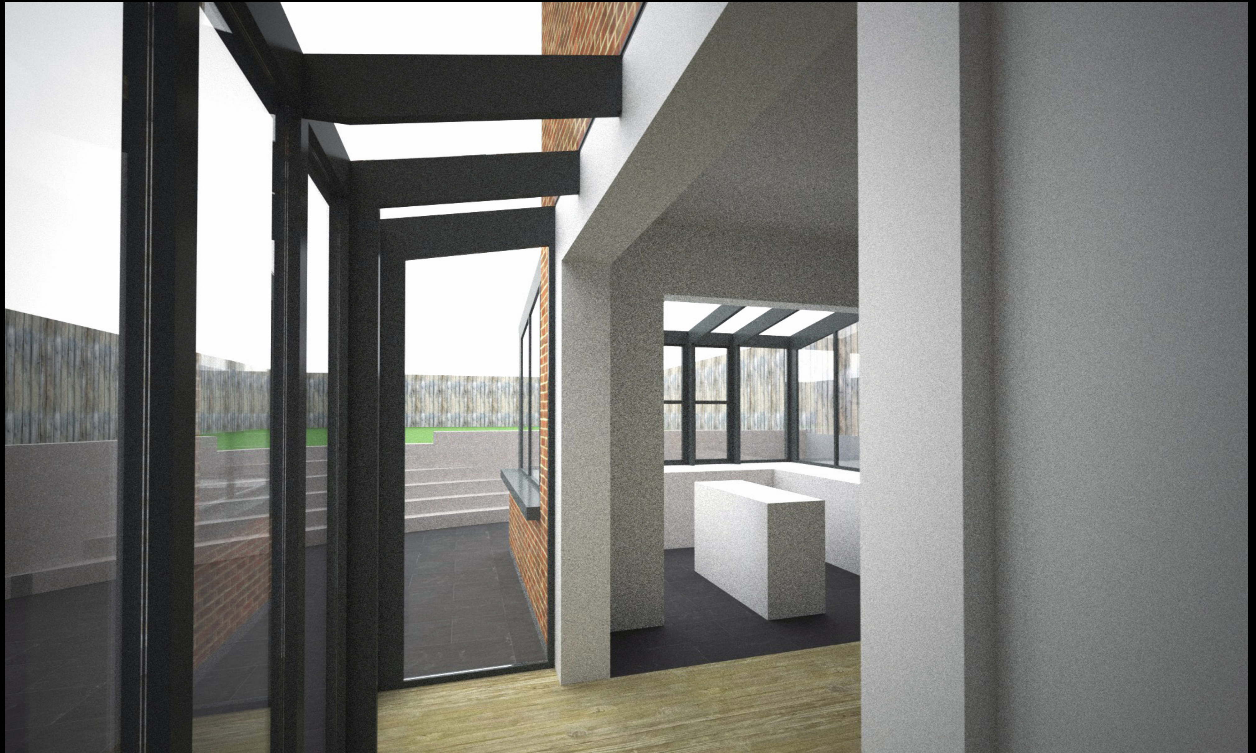
Flat 1, 14 Ferncroft Avenue - view inside proposed 'link' extension, facing Northeast