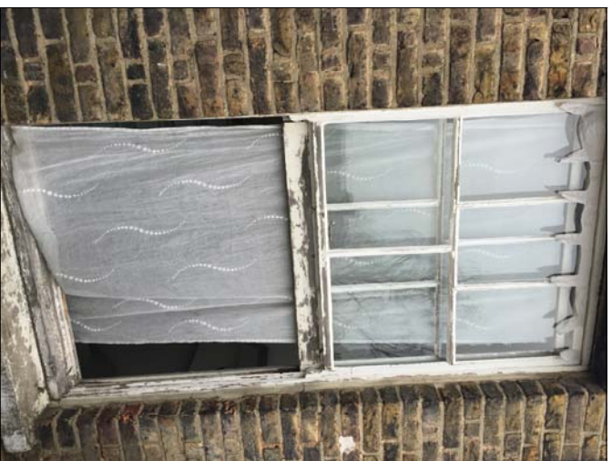
3 VIEW OUTSIDE WINDOW