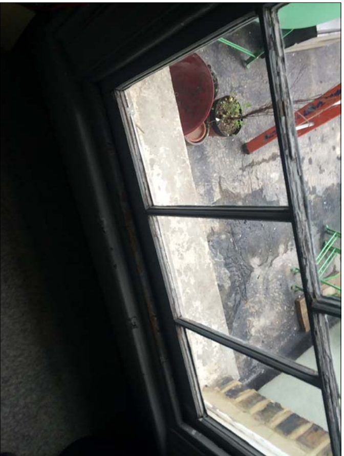
2 VIEW INSIDE WINDOW