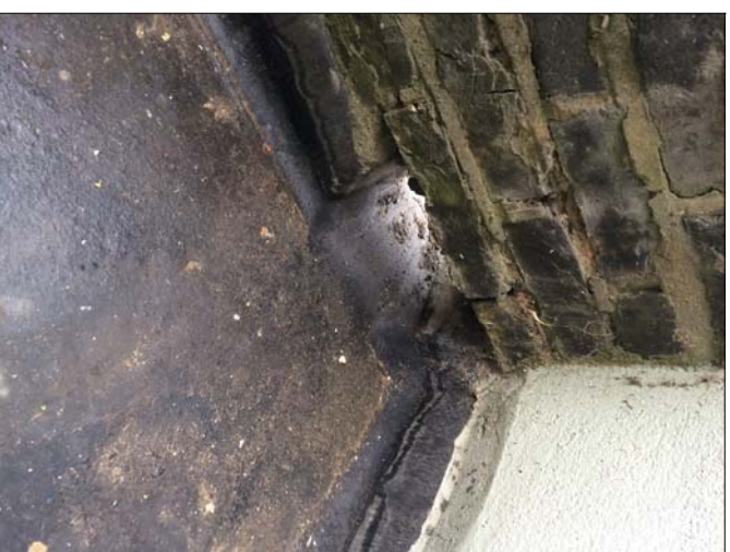
8 VIEW TERRACE BOTTOM RIGHT