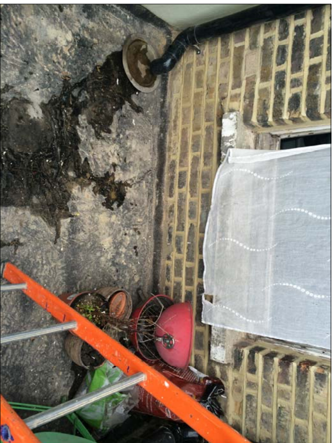
4 VIEW OUTSIDE WINDOW