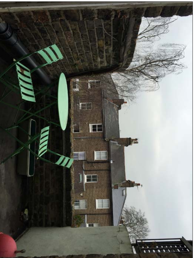
5 VIEW TERRACE