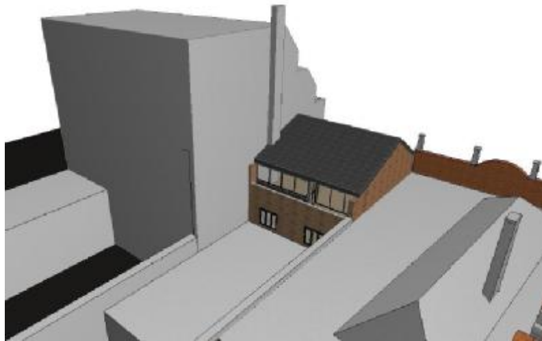
Below: Birdseye of rear elevation