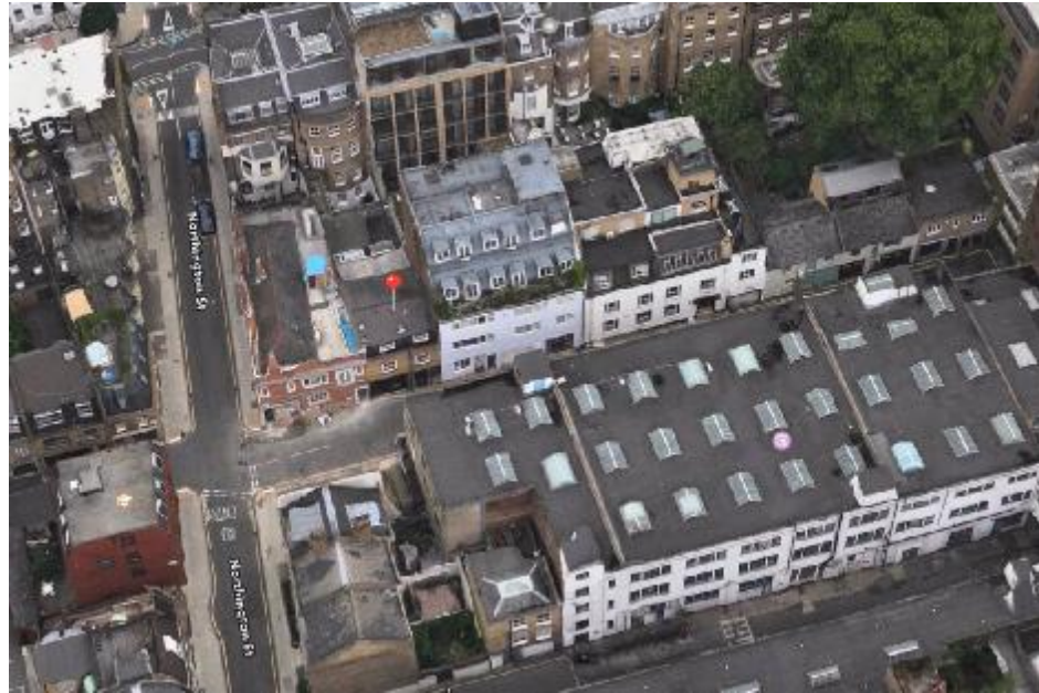
Below: Birdseye view of application site from north