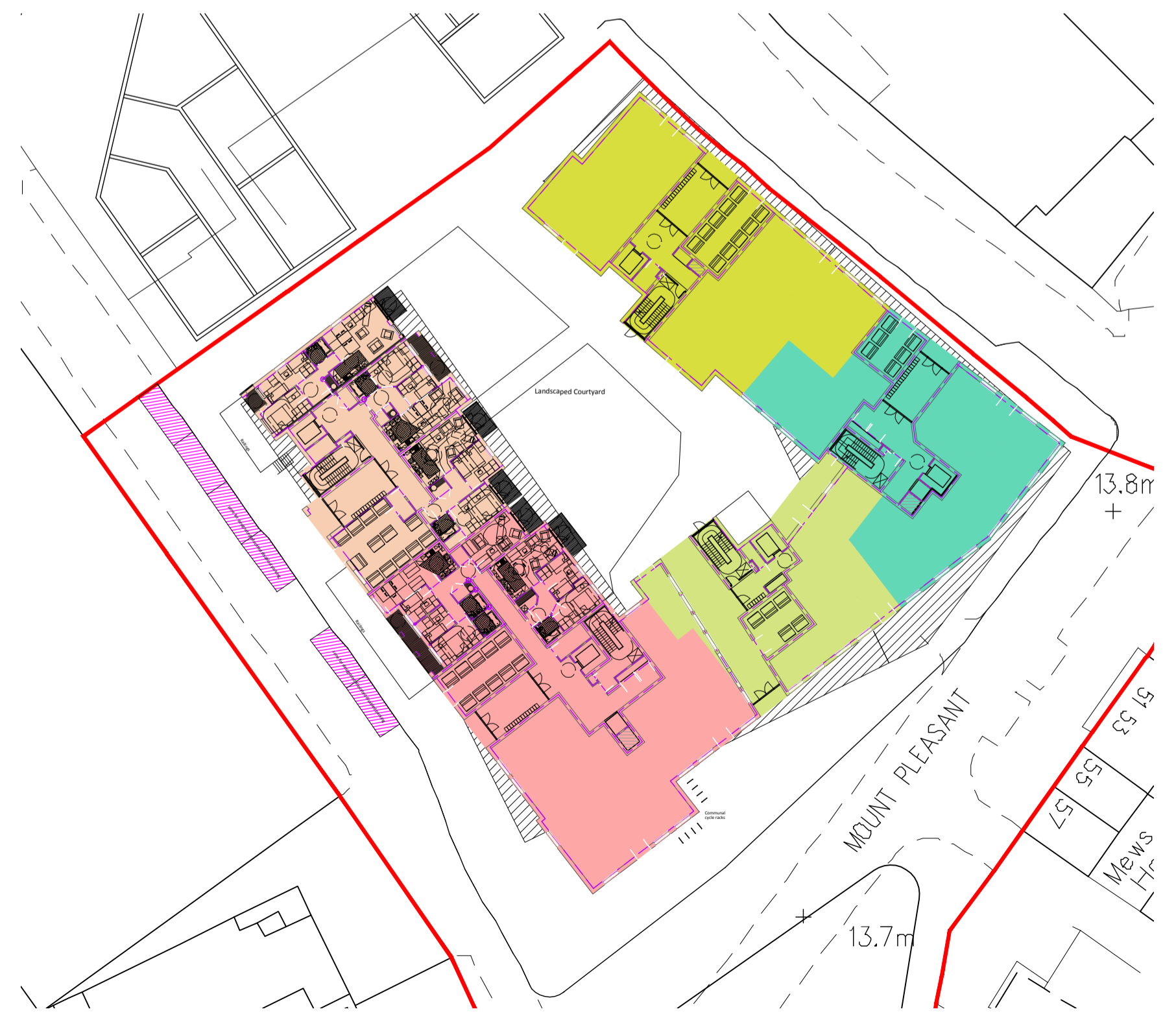
Key Plan Scale 1:500