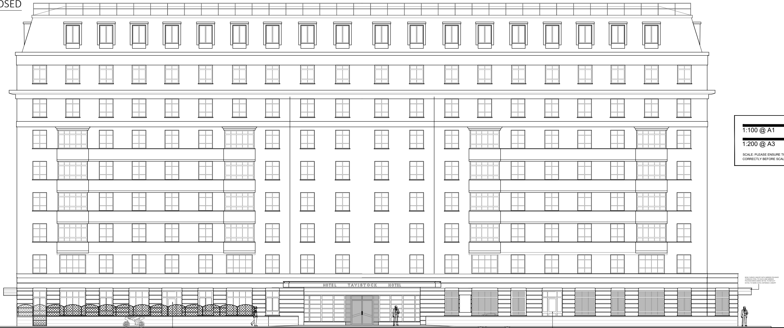
PROPOSED TAVISTOCK SQUARE ELEVATION Scale 1:100 @ A1