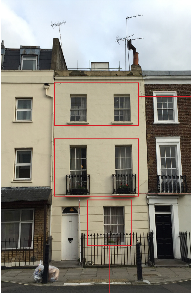
Arlington Road front view