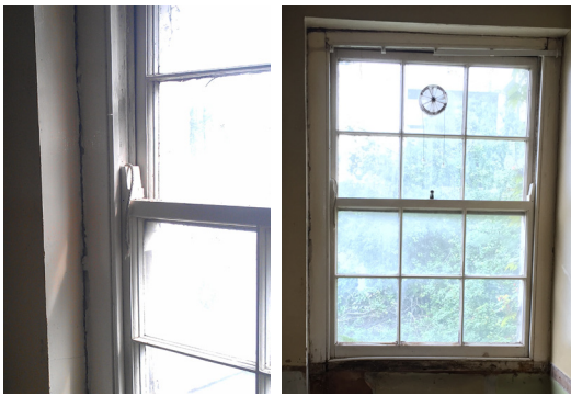
Second floor existing rear window not original- replaced in the 1970's with the refurbishment of the roof PROPOSAL- replace window to match original