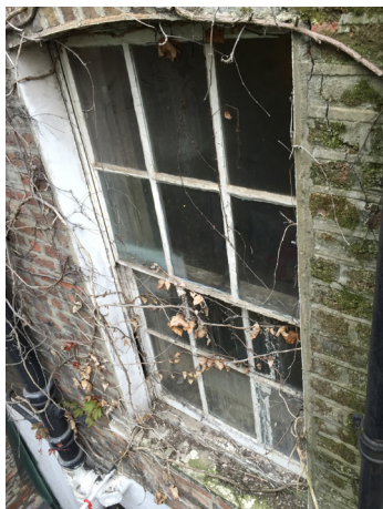
Ground floor rear window showing existing original single glazed sash window in poor condition PROPOSAL- replace window to match original