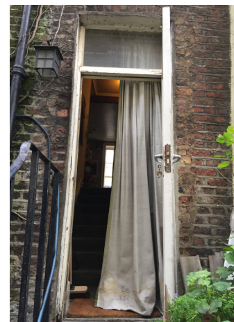
Ground floor landing rear door not original- PROPOSAL- replace door to match existing