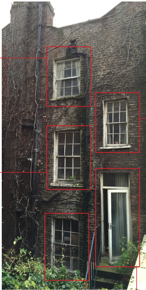
40 Arlington Road rear view