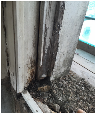
First floor existing original rear window showing single glazed sash window in poor condition PROPOSAL- replace window to match original