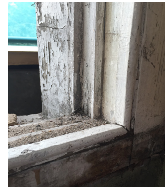
First floor landing rear window showing existing original single glazed sash window in poor condition PROPOSAL- replace window to match original