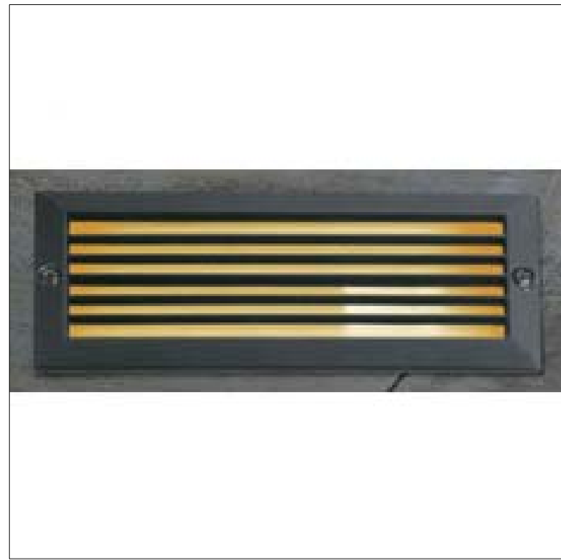
Sample of LED brick light