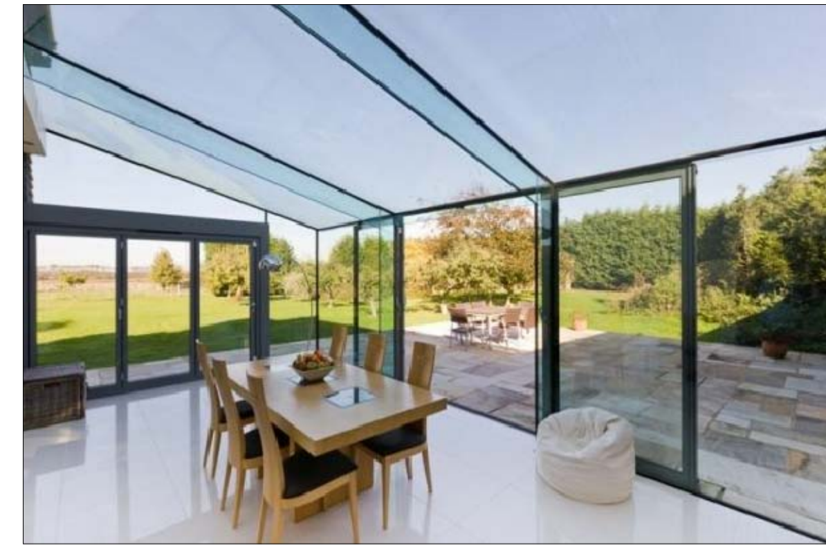
Sample of Frameless Glass Conservatory