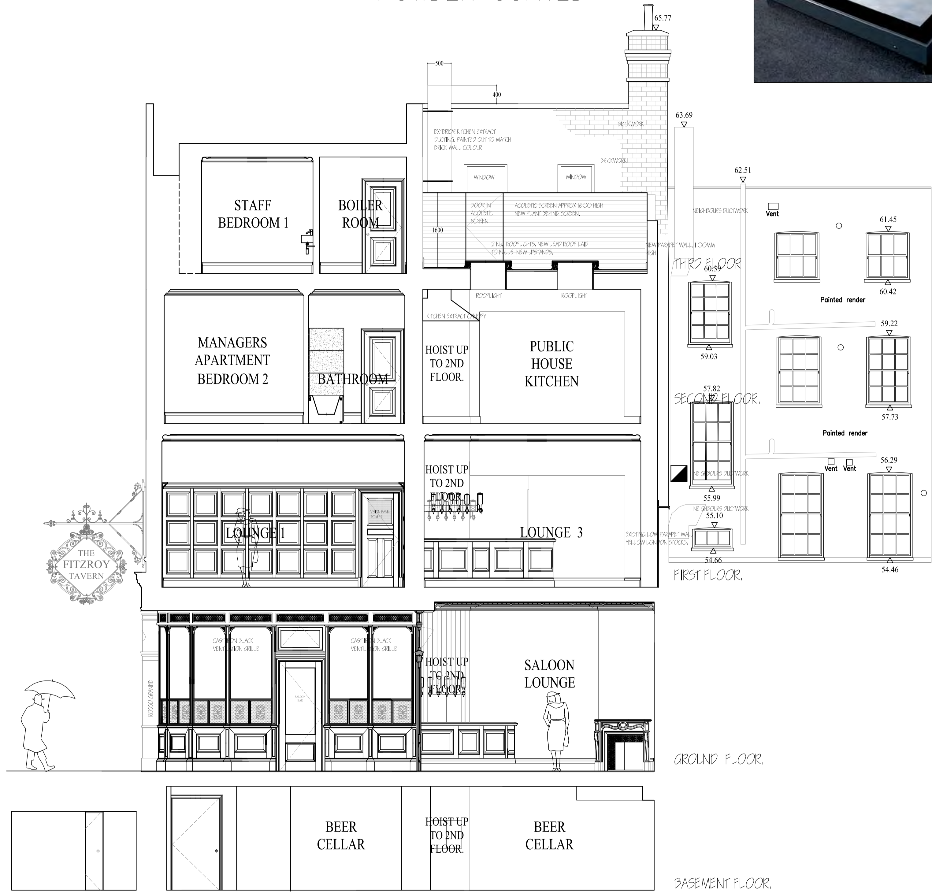
Section A - A