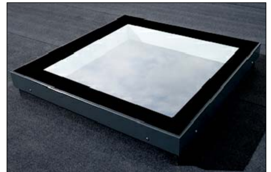
ROOFLIGHT TO SECOND FLOOR KITCHEN. POWDER COATED ALUMINIUM.