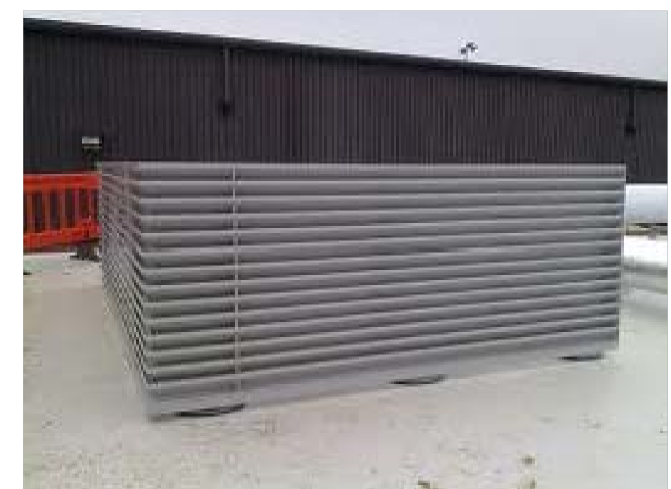
EXAMPLE OF ACOUSTIC LOUVRED PANELS