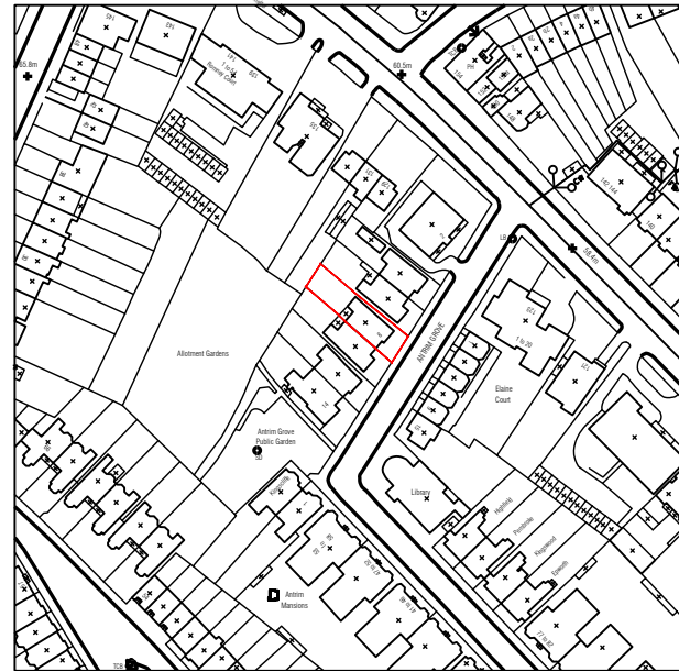
1 Site Plan 1:2500 @A3 Scale = M

1. Refer to Scale Bar & Title Block for draw Scale. 2. Check all dimensions on site before work is commenced. 3. All goods, materials and workmanship to conform with current building, fire and safety regulations. All specified products installed to manufacturers' specifications.