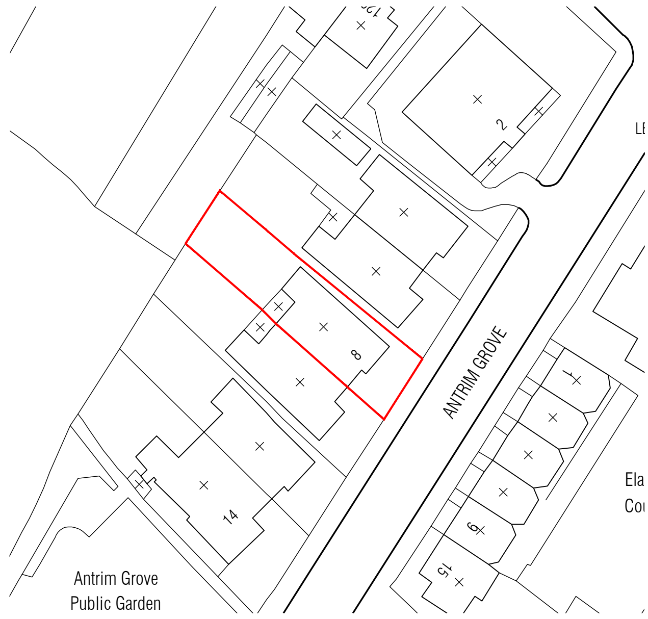
2 Block Plan 1:500 @A3 Scale = M