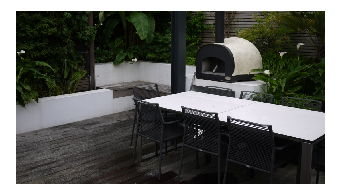
NB: The fixed corner seat centre of photo allows access behind the living wall to pumping equipment/plant and general storage.