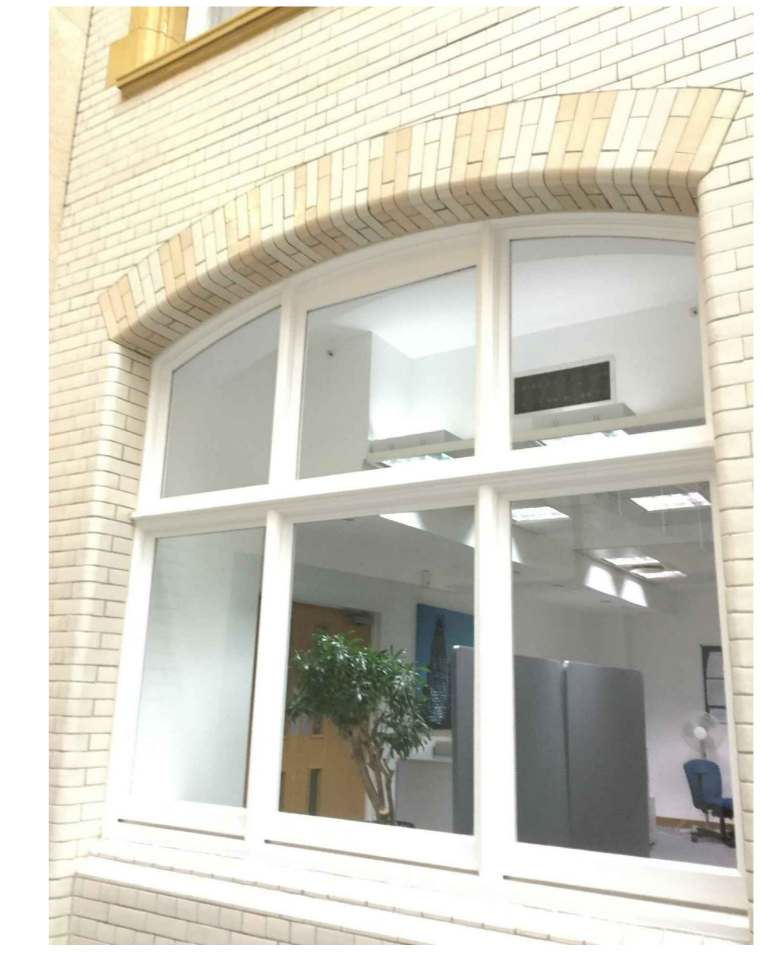
DETAIL OF WINDOW ELEVATION A NOT TO SCALE