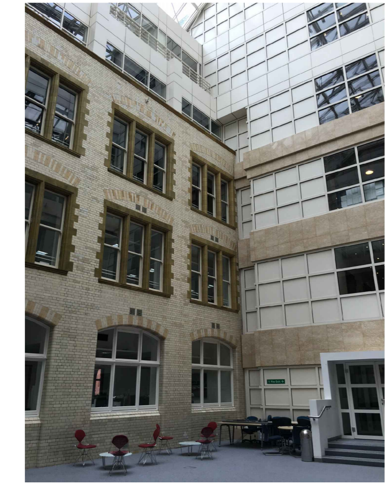
CORNER OF ELEVATION A + B NOT TO SCALE