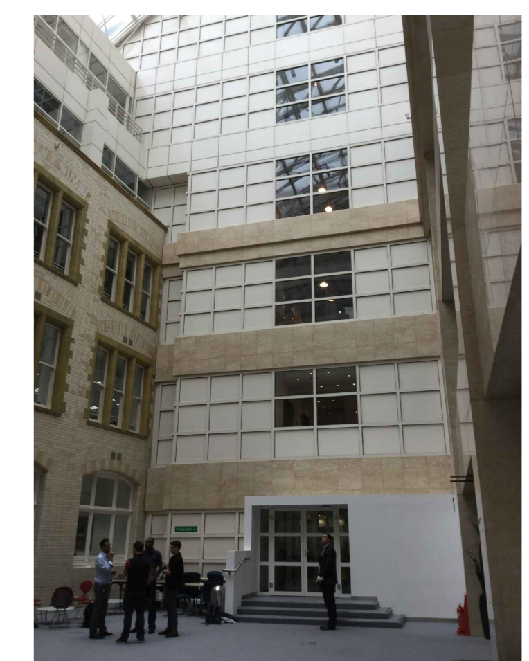
ELEVATION B NOT TO SCALE