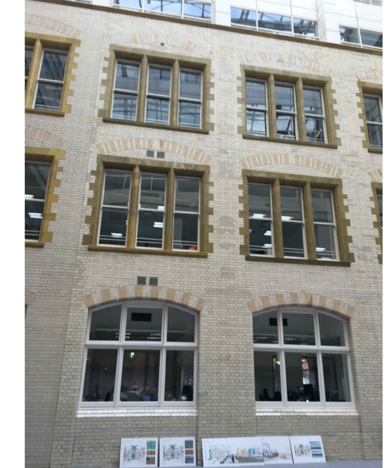
ELEVATION A NOT TO SCALE