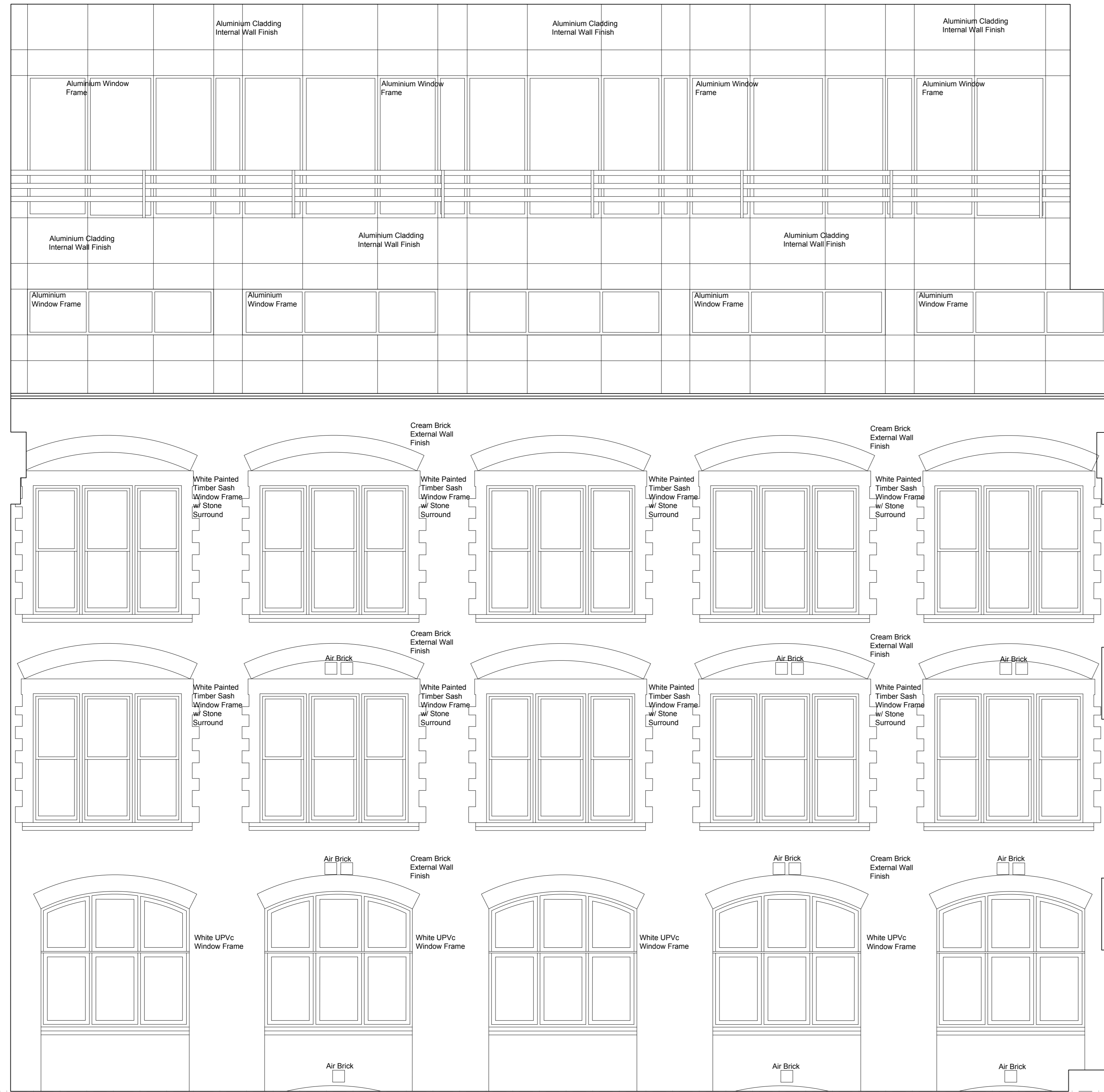
ELEVATION A SCALE 1:50