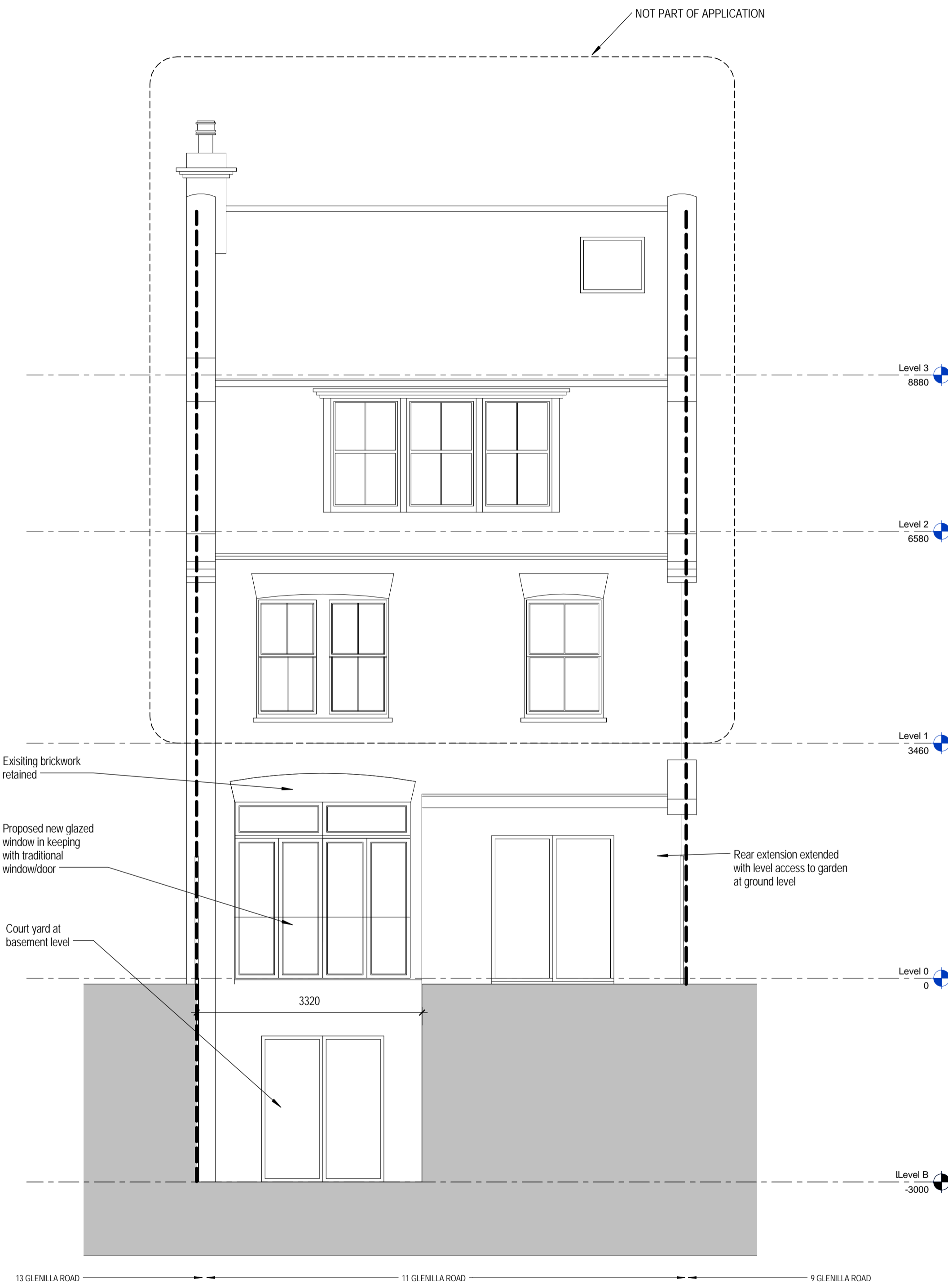
② PROPOSED REAR ELEVATION SCALE: 1:50