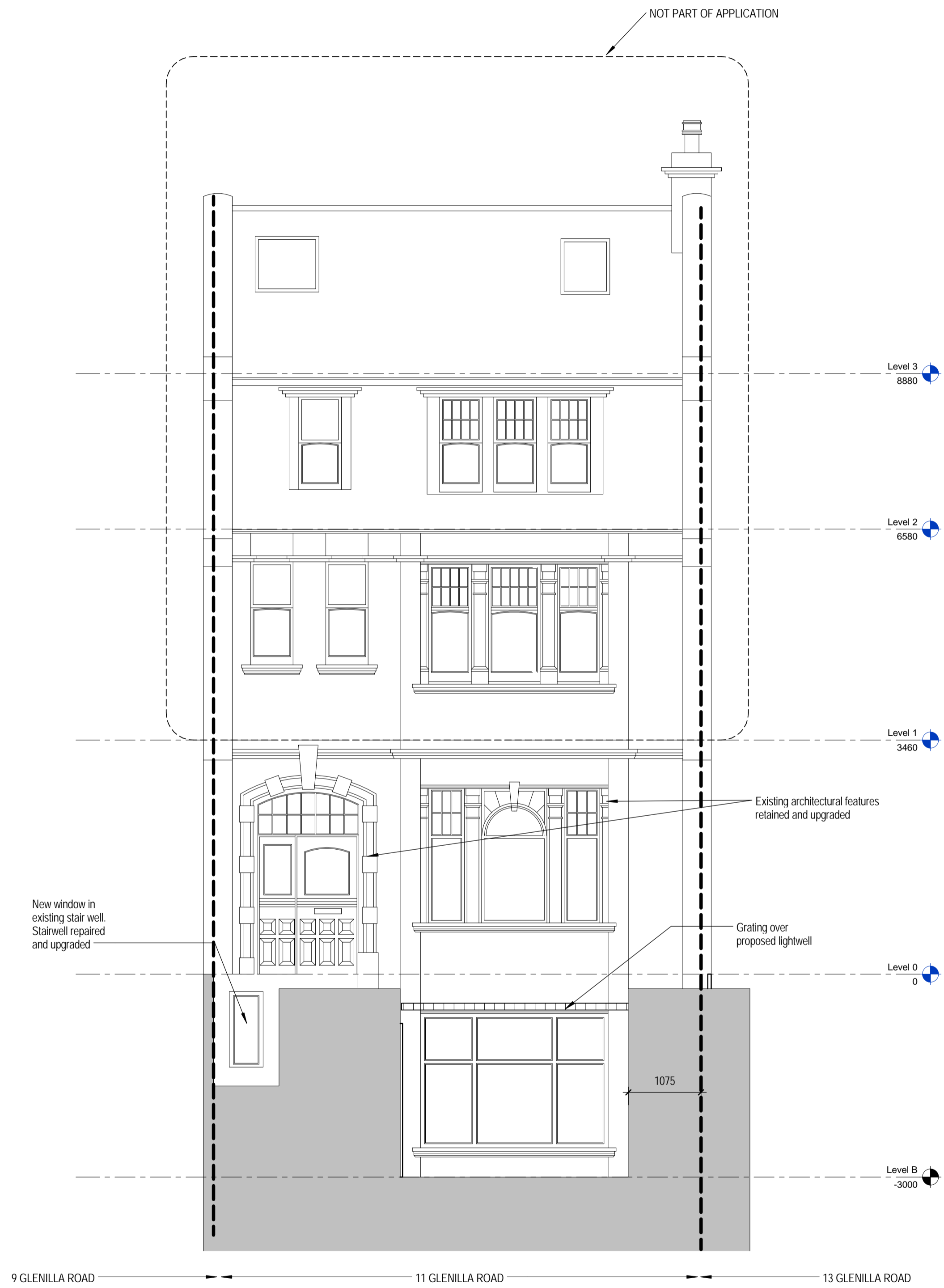
① PROPOSED FRONT ELEVATION SCALE: 1:50

Notes: 1. All dimensions and levels are in millimetres unless otherwise noted 2. Do not scale from this drawing 3. All dimensions and levels are to be confirmed