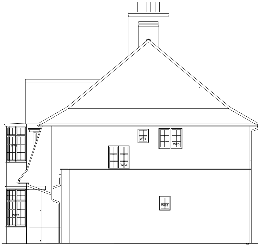
49 Swains Lane - East Elevation