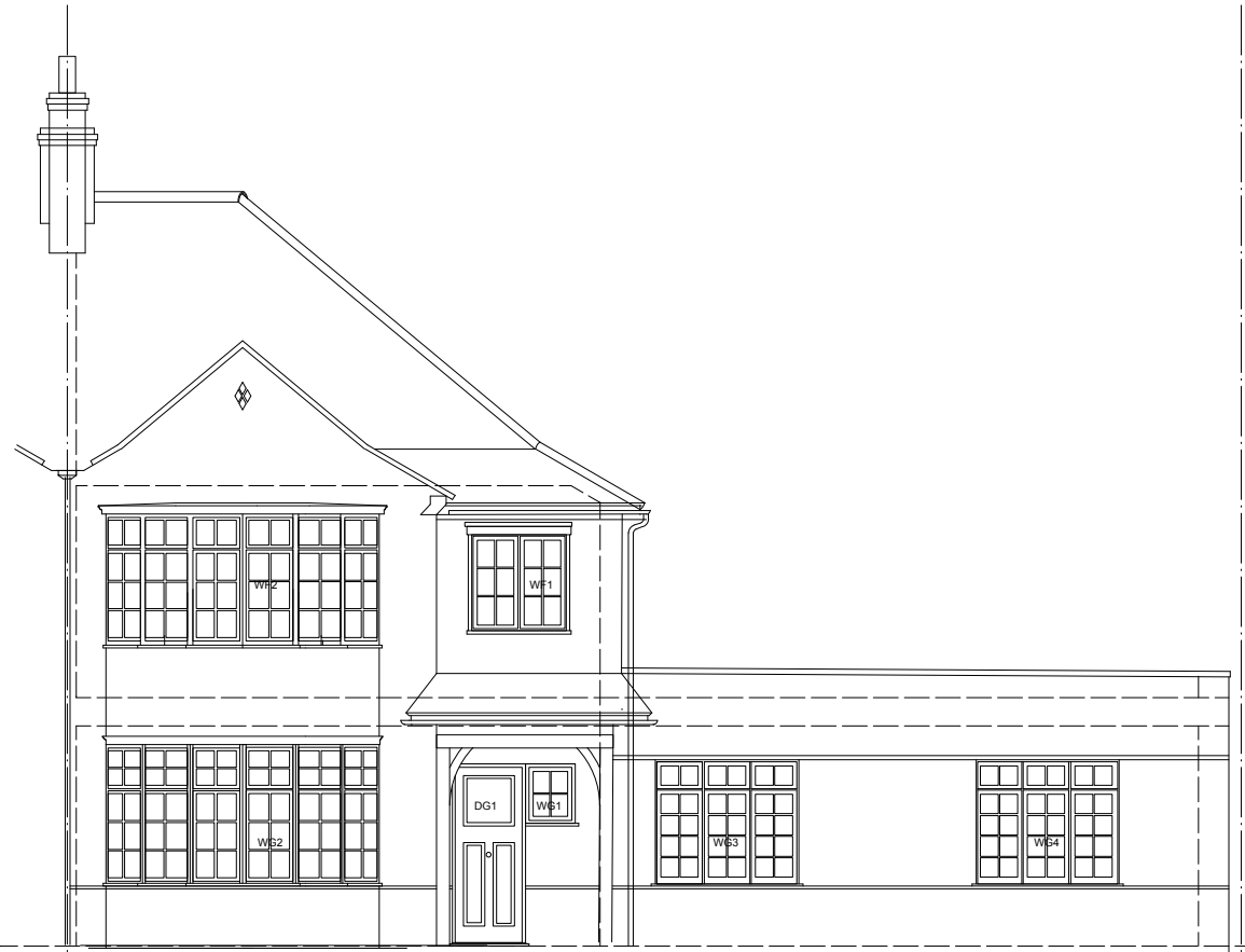
49 Swains Lane

PROJECT ALTERATIONS and EXTENSION to HOUSE at 49 SWAINS LANE, LONDON N6 6QL