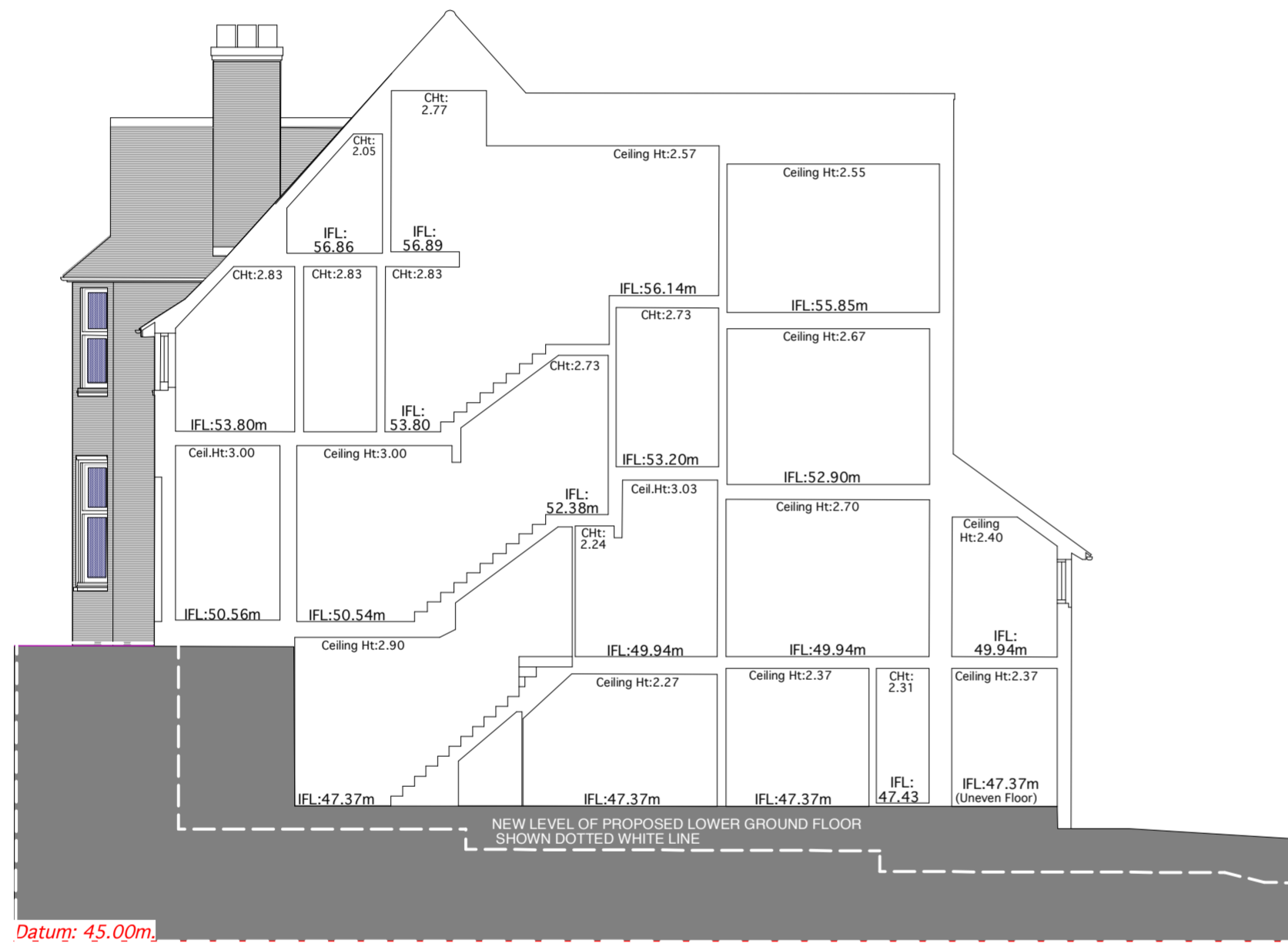
SECTION A-A INFORMATION