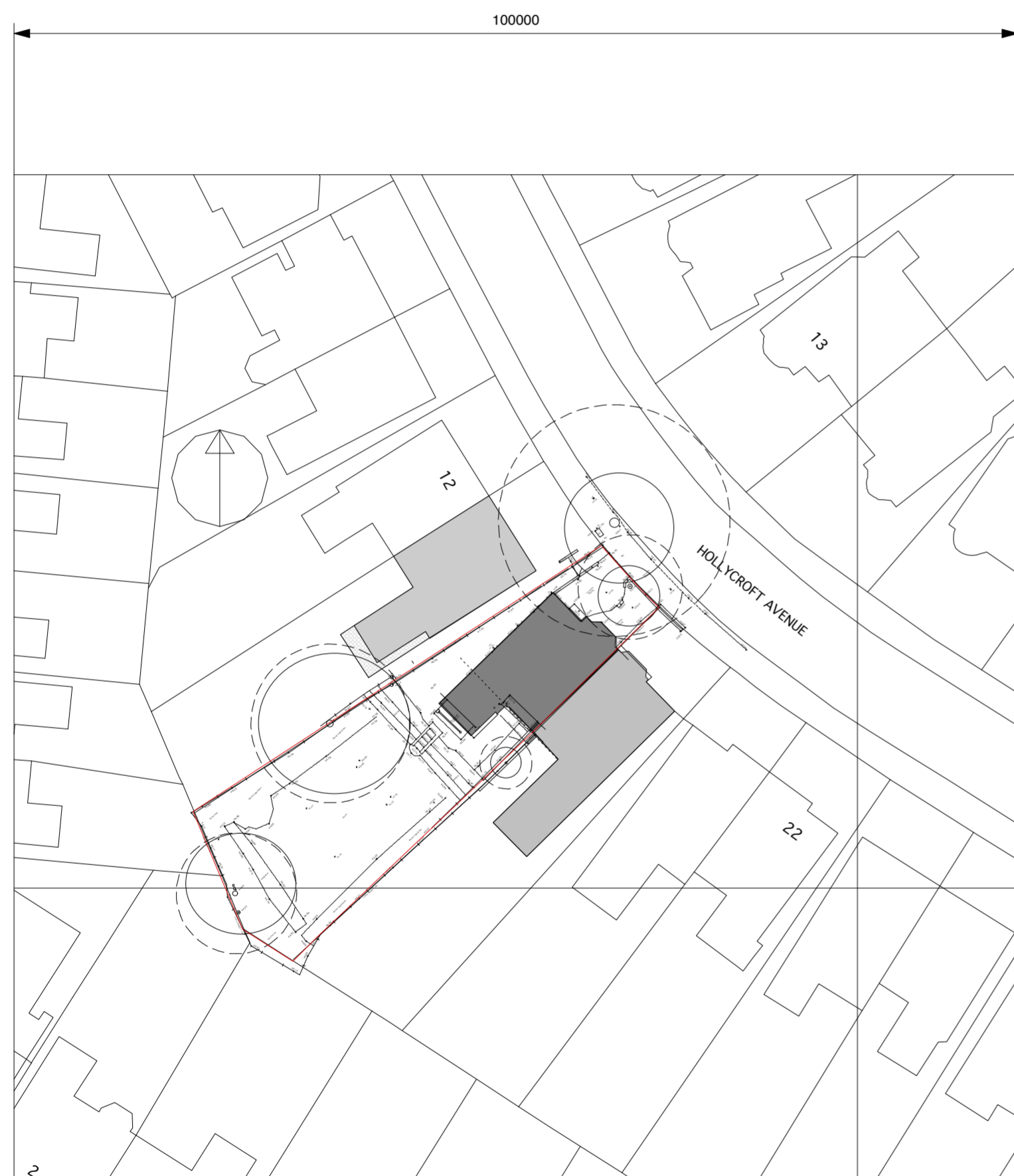
EXISTING SITE PLAN - scale 1: 500 @ A2 size