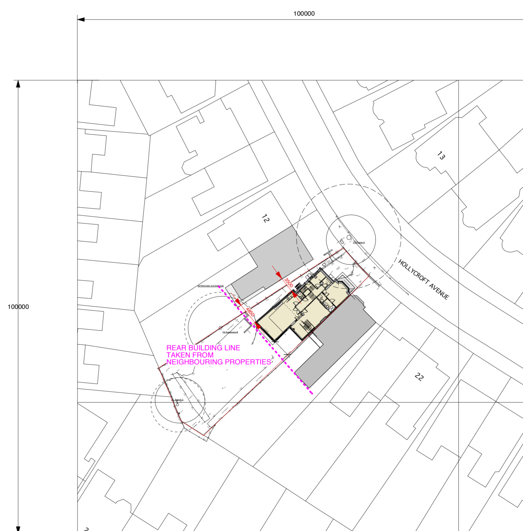
PROPOSED SITE PLAN - scale 1: 500 @ A2 size