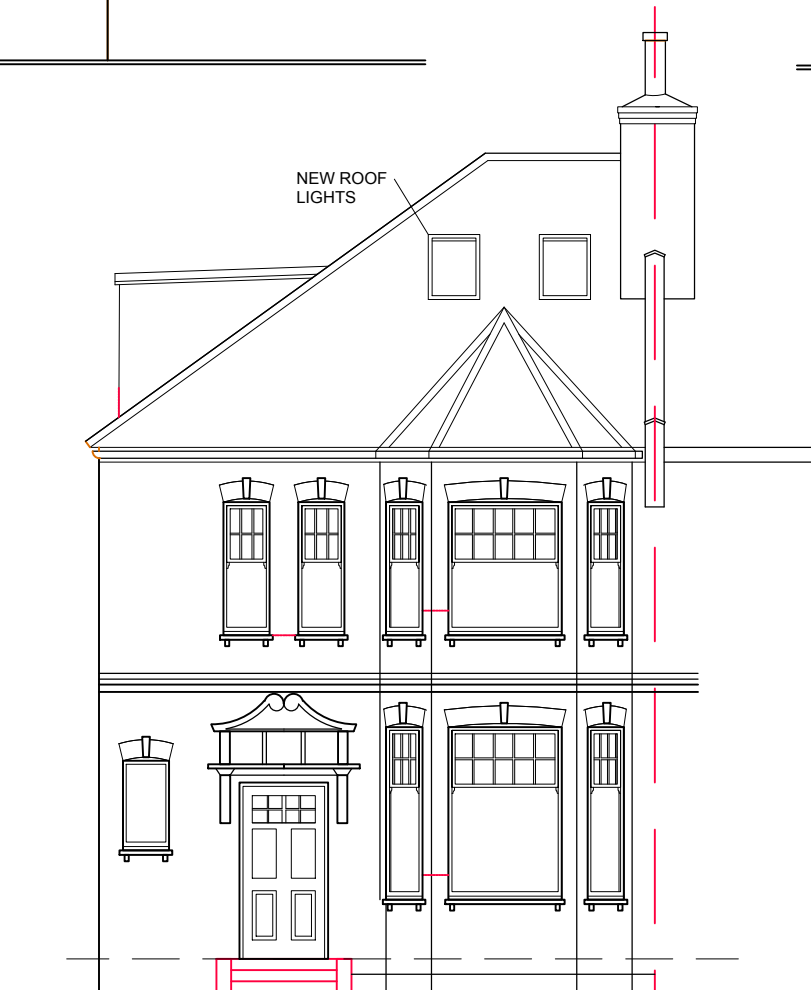
MINSTER ROAD ELEVATION Scale 1:100@A3