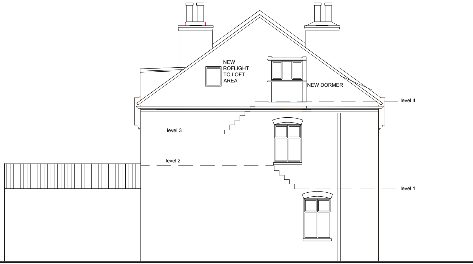
SIDE ELEVATION Scale 1:100@A3

note: ALL PROPOSALS SUBJECT TO PLANNING PROPOSALS SUBJECT TO BUILDING REGULATIONS DO NOT SCALE FROM THIS DRAWING THE INFORMATION CONTAINED IN THIS DRAWING IS ONLY FOR THE PURPOSES AS STATED IN THE TITLE BLOCK. NOT FOR CONSTRUCTION UNLESS STATED COPYRIGHT IS OWNED BY TO NICHOLAS WILLIAMS