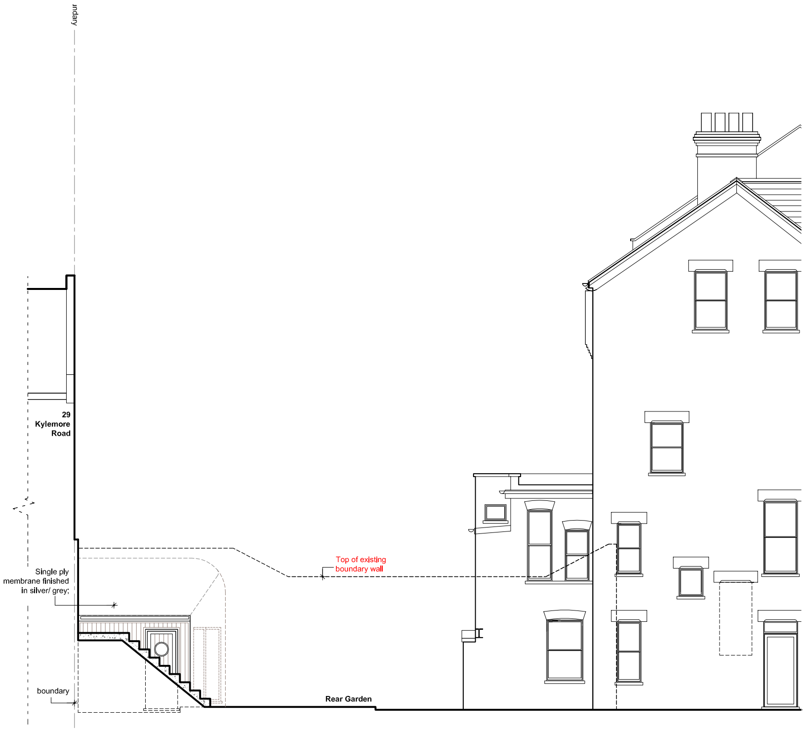
Proposed Side Elevation/ Section - West

Notes Do not scale from this drawing Report any discrepancies Copyright owned by Andreas + Buxton Associates