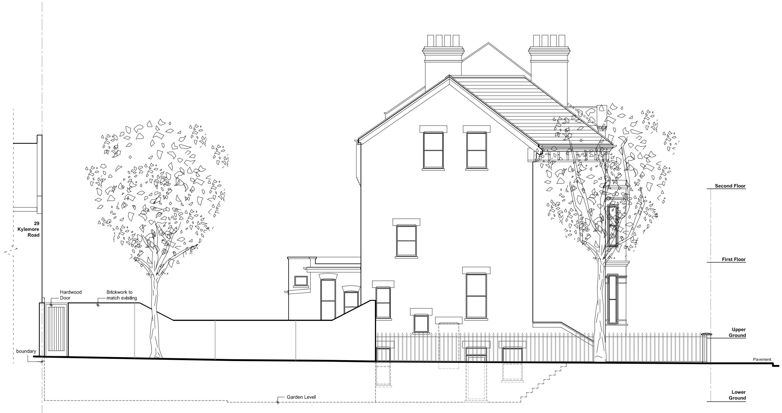
Proposed Side Elevation - West

Notes Do not scale from this drawing Report any discrepancies Copyright owned by Andreas + Buxton Associates