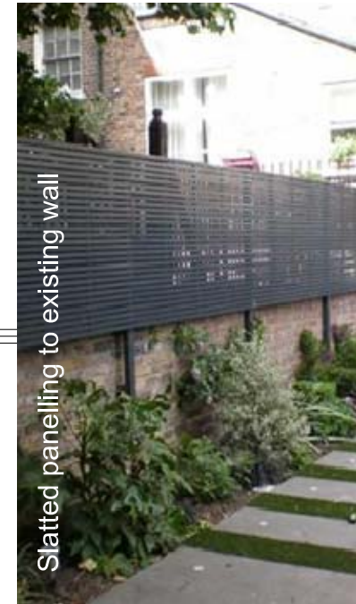
Slatted panelling to existing wall