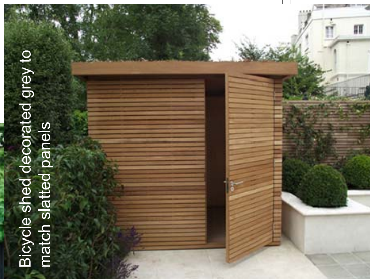
Bicycle shed decorated grey to match slatted panels