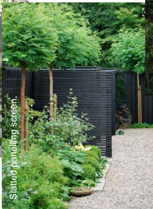
Slatted panelling screen.