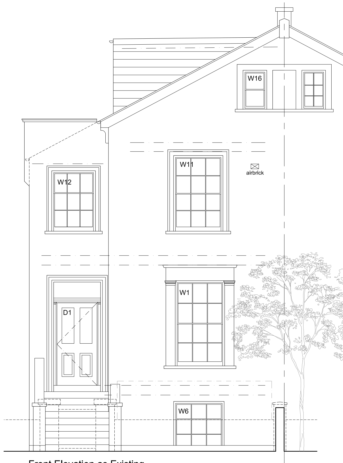
Front Elevation as Existing