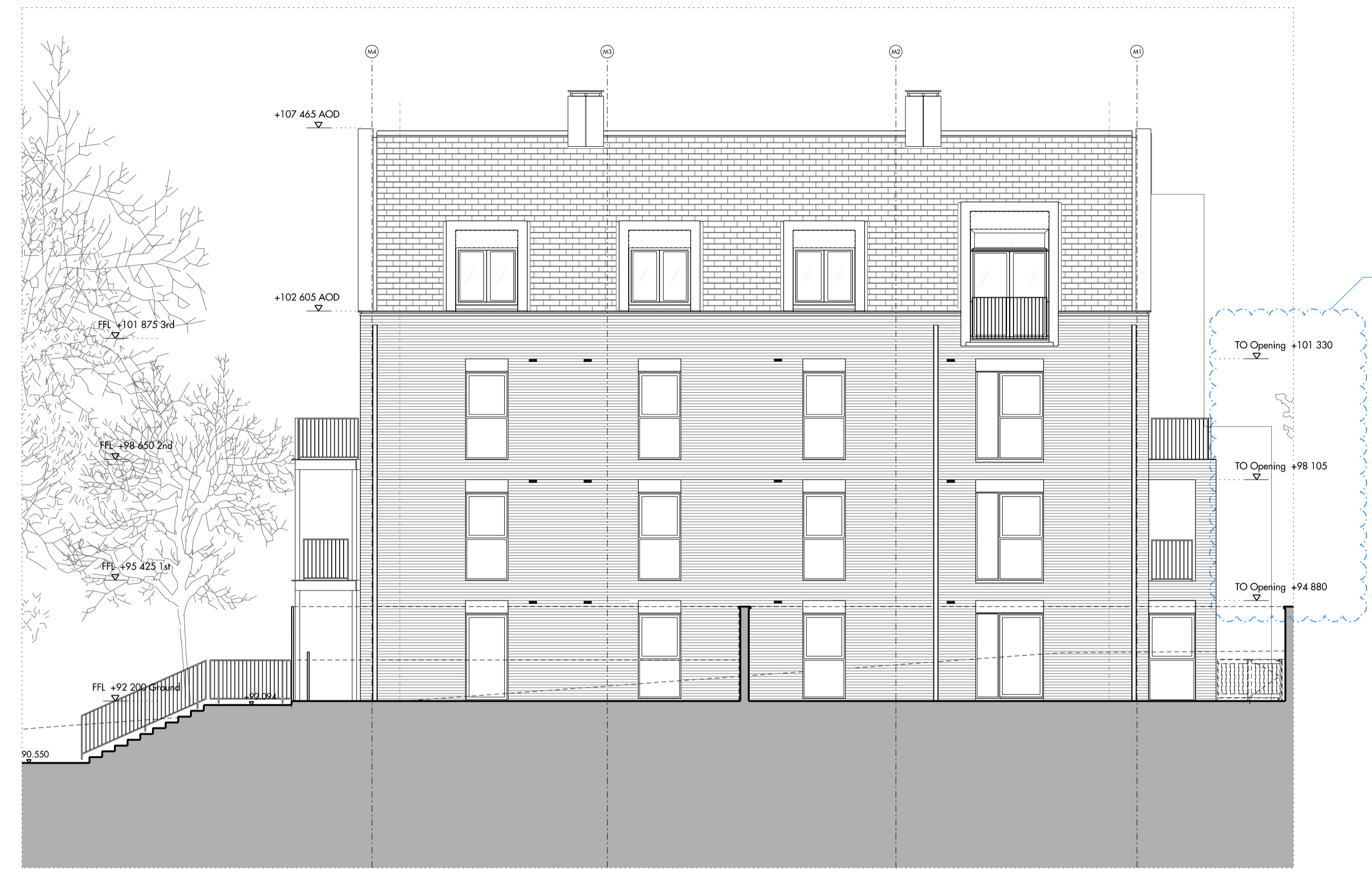
02 BLOCK M/ ELEVATION- SOUTH EAST