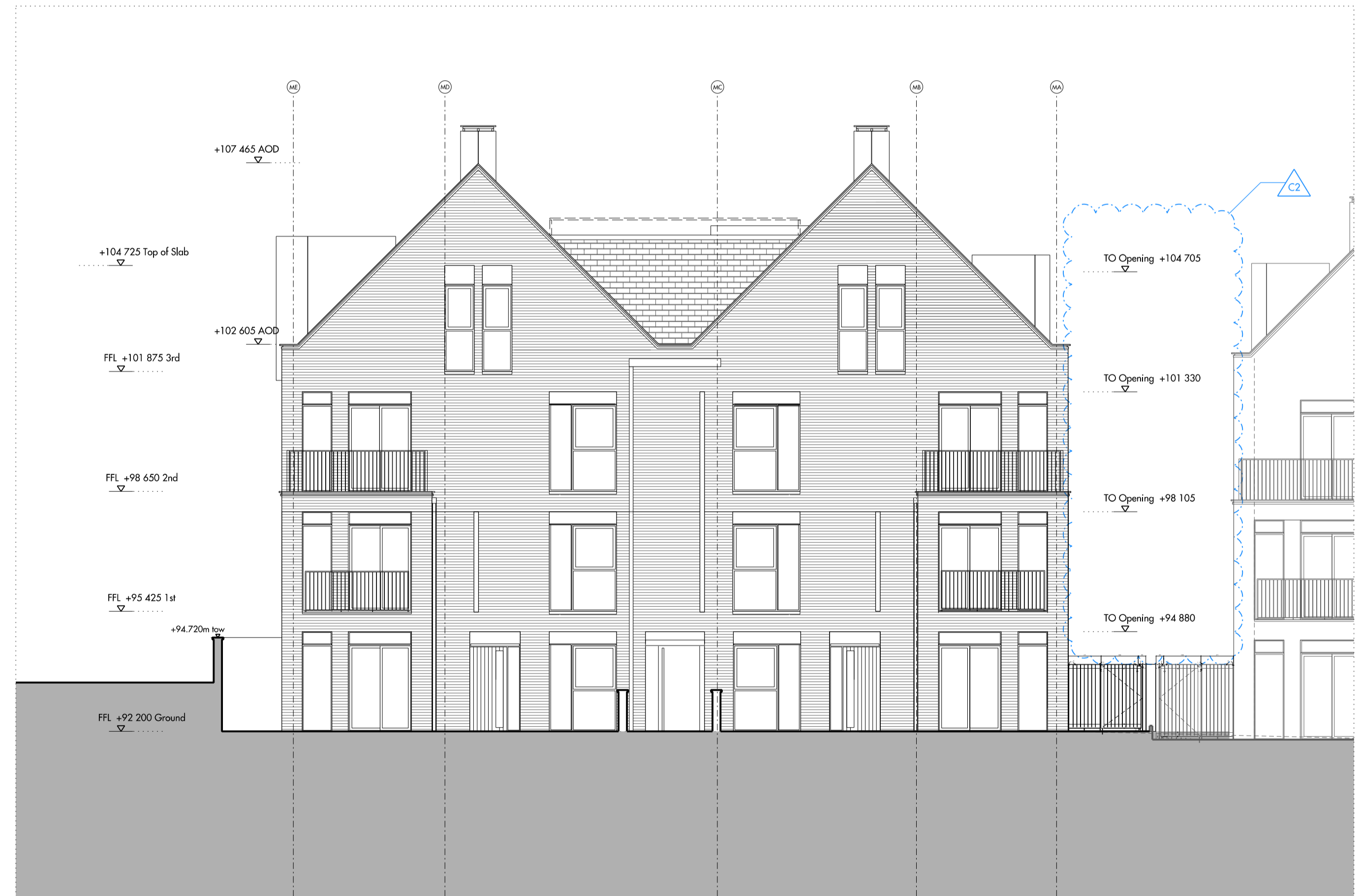
03 BLOCK M / ELEVATION- NORTH EAST KIDDERPORE AVENUE