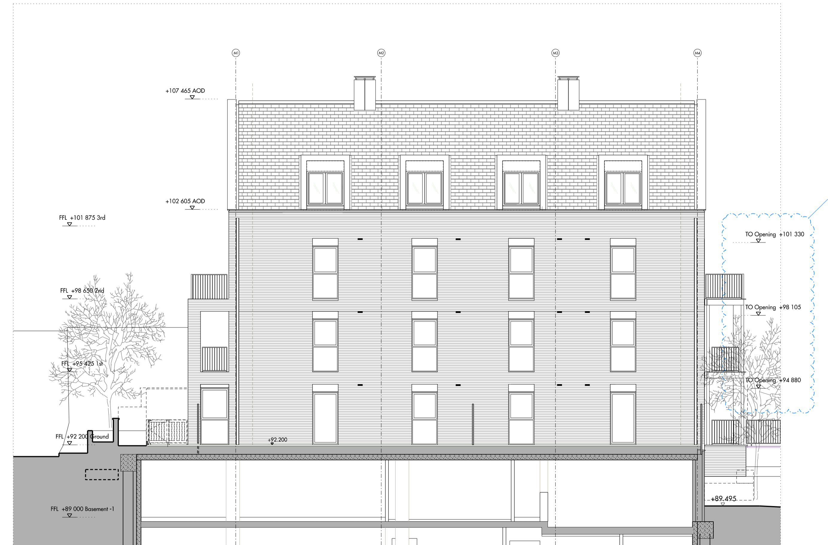
04 BLOCK M/ ELEVATION- NORTH WEST