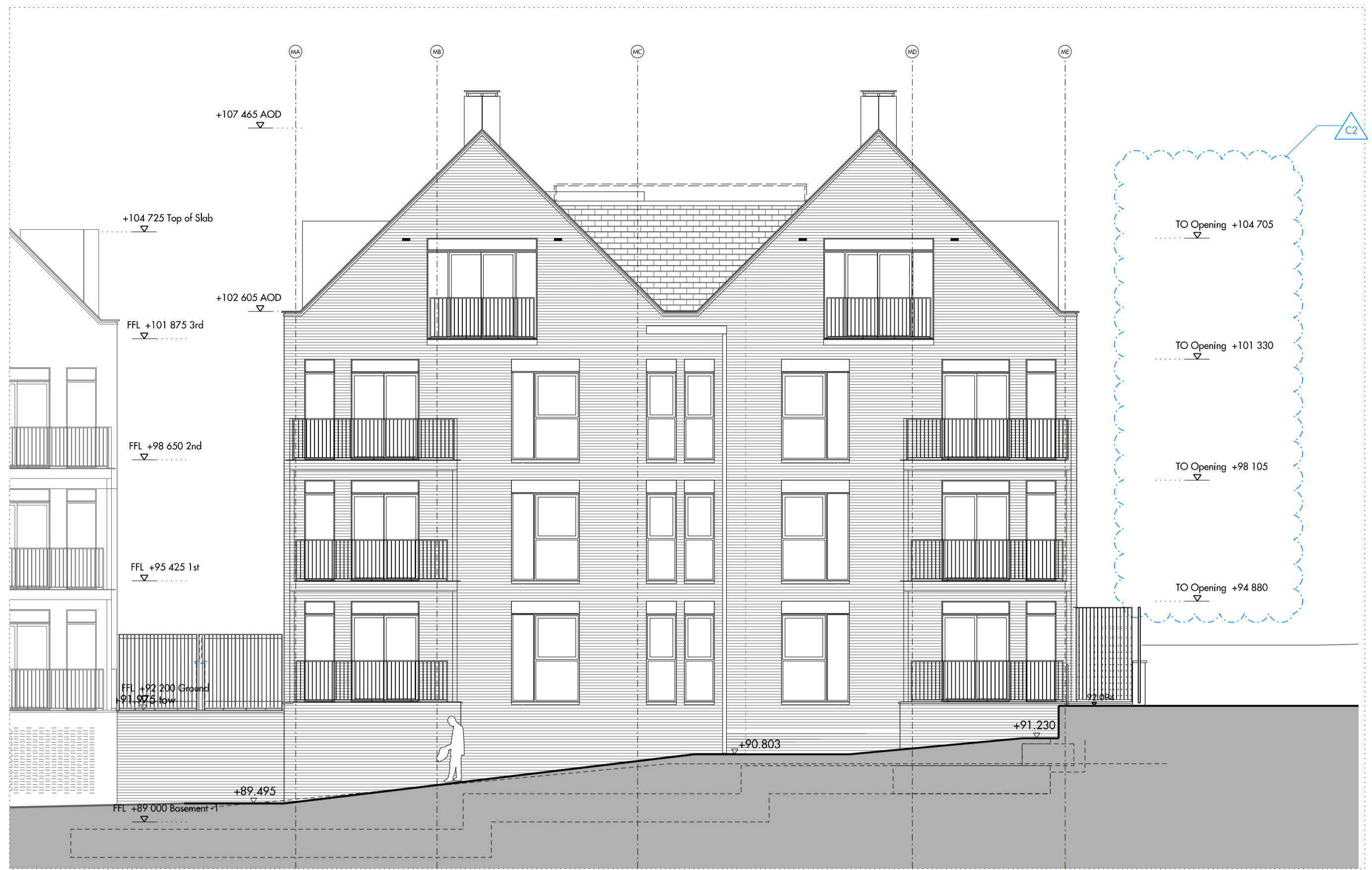
01 BLOCK M/ ELEVATION- SOUTH WEST COMMUNAL GARDEN