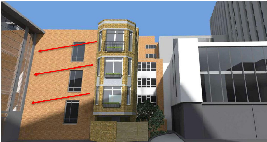
Fig. 4 Submitted visuals annotated to show the potential overlooking

The figures below illustrate the view from the windows facing the entrance of The Place. Given that this frontage is only approximately 7 metres from the frontage of The Place, this proximity will create significant overlooking and a sense of intrusion that will be harmful to the necessary creativity and concentration within the dance environment.