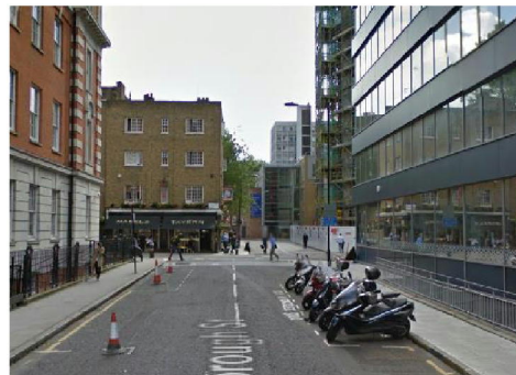
Fig. 3 View looking towards The Place and the application site from Bidborough Street