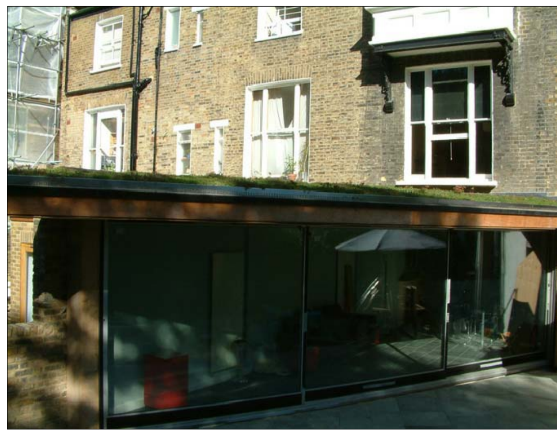
Sample of Green Roof