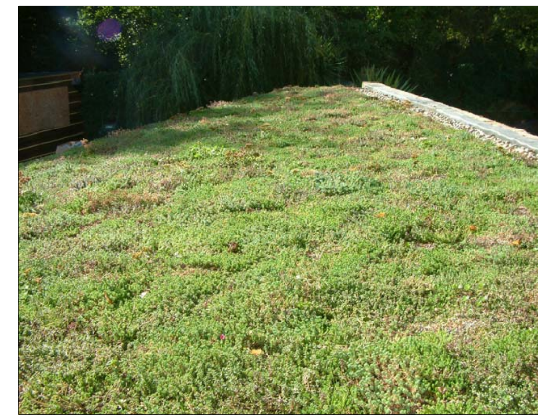
Sample of Green Roof