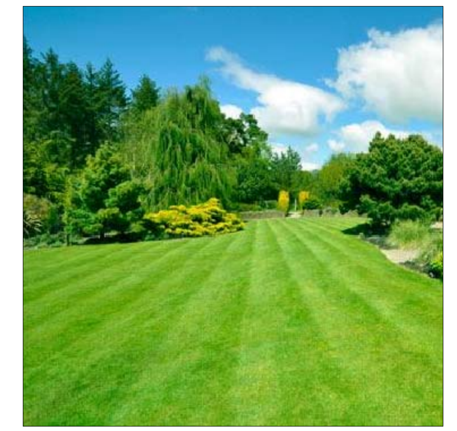
Sample of Turf