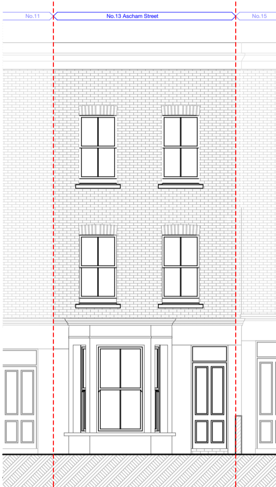
E1 - Front Elevation - No changes