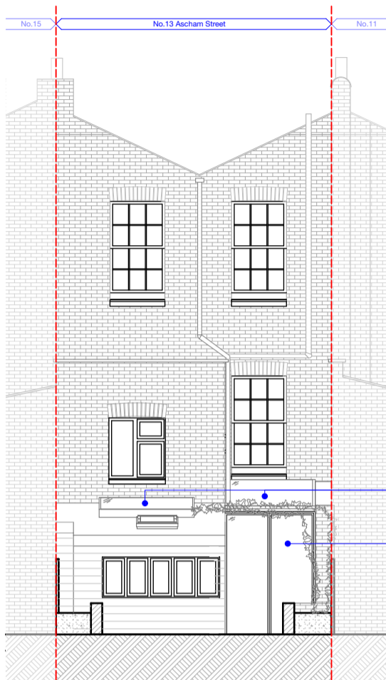
E2 - Rear Elevation